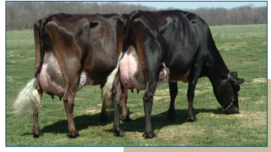
When introduced to other breeds, Jersey genetics consistently increase fat and protein yields and percentages, plus fertility and productive life. The use of top-ranked A.I. proven bulls will make this effect even greater because they are more intensely selected for than the average natural service sire.

Source: Annual NDHIA Reports (2012), accessed at http://aipl.arsusda.gov/publish/dhi/cull.html