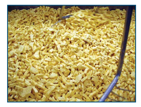
Products are manufactured from Jersey milk more efficiently, and also are of higher quality because more protein is recovered in the cheese and the curd is firmer.

Source: National Dairy Herd Information Association (NDHIA) Annual Report, 2013. Calculations by National All-Jersey Inc.