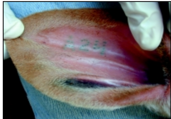
A legal tattoo has at least one number and one letter. After several weeks, the tattoo should become legible as the dried ink flakes out of the calf's ear.

Sanitize tongs between calves by spraying rubbing alcohol on the tongs and the individual tattoo pieces. This should be done before and after each procedure.