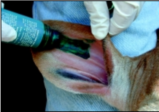
Apply ink between the first and second ribs. The ink should thoroughly cover the skin.

Many brands of indelible ink are available through your supply house. The roll-on applicators have been proven to save ink and make the job cleaner.