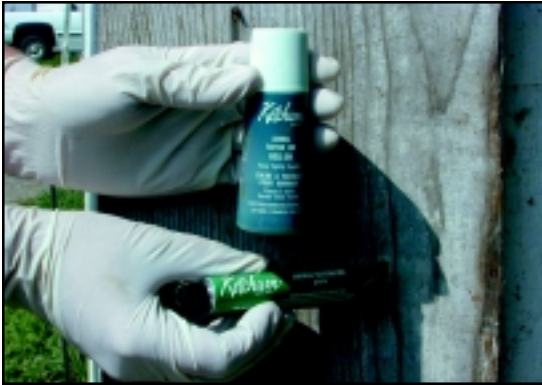
Two varieties of ink available are the roll-on (top) and the paste (bottom). The roll-on variety is most commonly used.