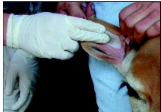
A clean ear is the first step to a successful tattoo. Clipping ears may be necessary to avoid interference from hair.

If no alcohol pads are available, rubbing alcohol and a soft, clean cloth will also work, as long as the wax is completely removed.