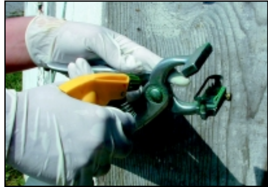
Sanitizing tattooing equipment is just one way to follow biosecurity protocol.