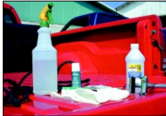
Gathering materials is the first step in getting ready to tattoo.