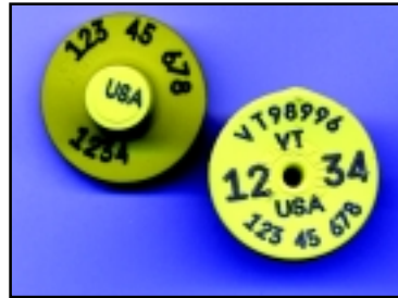
Allflex Tamperproof™ Ear Tags

Prior to leaving individual pens or ties, all calves identified by eartags must be identified in both ears with tags approved by the Association's Board of Directors. These tags will include an American ID number, state of origin, and herd management number. No two animals in the same herd of the same sex may have the same herd management number.