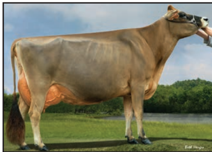
BUDJON-VAIL JADE GIANNA-ET Fourth Dam of Lot 1