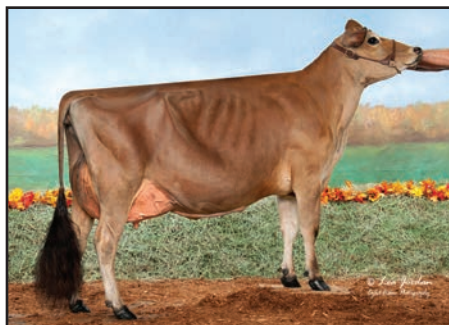
Intense Gentry Priceless, VG-86% 2-1 305 12,570 4.4% 557 3.5% 443 Sold in 2017