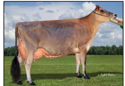
WOODMOHR GENTY GIN-ET From the Same Family as Lot 13