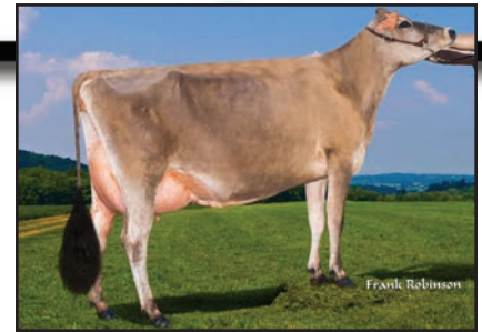
CLAQUATO PREMIER FIRE-ET Sister to the Dam of Lot 9

4TH DAM: FAMILY HILL SD FAVORITE 95% 6-07 305 2 20940 4.3 900 3.7 775 97DCR 2516C RES. SR & RES. GRAND CHAMPION, 2006 WESTERN NATIONAL RESERVE INTERMEDIATE CHAMPION, 2004 ALL AMERICAN ALL AMERICAN JR 3-YEAR-OLD, 2004 1ST 5-YEAR-OLD, 2006 WESTERN NATIONAL 1ST PREMIER PERFORMANCE 4-YEAR-OLD, 2005 ALL AMERICAN 2ND 4-YEAR-OLD, 2005 ALL AMERICAN JERSEY SHOW 6TH OVERALL PREMIER PERFORMANCE, 2005 ALL AMERICAN 7TH 5-YEAR-OLD, 2006 ALL AMERICAN JERSEY SHOW