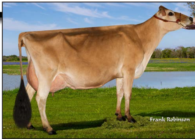
GENESIS VIVITAR PIPPI, E-90% Grandam of Lot 10