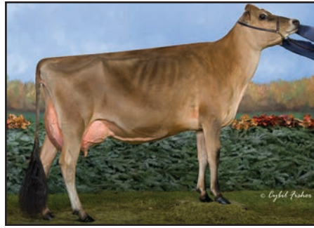
Avonlea Salty Kisses-ET, E-93% 2-9 297 15,551 5.4% 833 3.9% 612 Sold in 2011