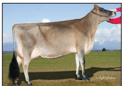
FAMILY HILL CONNECTION FAITH Great-Grandam of Lot 9