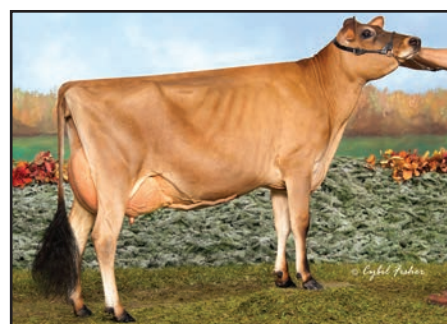
Mead-Manor Tequila Peaches, VG-87% Sister to the dam of "Pryia" and Dam of "Penny" Sold in 2016