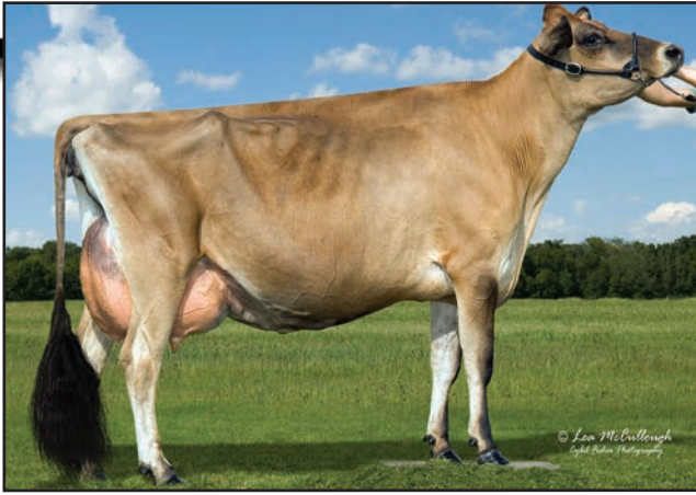
SHADY SPACE KAPTAIN JENNA, E-94% Fourth Dam of Lot 15