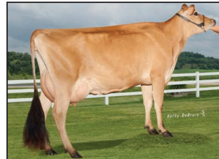
Spring Creek T-Bone Netty-ET, E-92% 4-1 305 3x 33,460 4.2% 1,412 3.5% 1,161 Sold in 2010