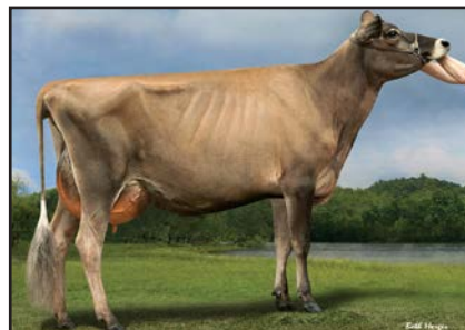
WOODMOHR PURE IMPRESSION Sister of Lot 12