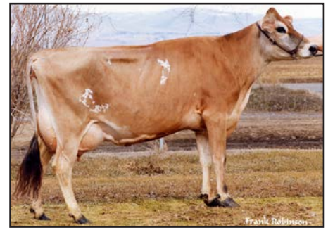
Avon Road Select Libby, E-91% 4-1 305 3x 17,870 4.8% 851 3.6% 649 Sold in 1999