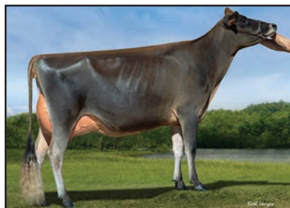
WOODMOHR V DIAMOND-ET Sister of Dam of Lot 12

PA -1340M -37F -42P -471CM$ -471NM$ -468FM$ 0.9PL 1.7DPR 1.7CCR -0.7HCR 3.03SCS PA TYPE 0.3 JPI 36%R -107 ST SR DF RA RW RL FA FU 0.8 0.0 -0.6 H1.5 0.8 P1.0 S0.8 2.1 RH RUW UC UD TP TL RTR RTS -0.2 -0.9 -0.4 S2.7 C0.4 L0.0