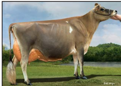
WOODMOHR PURE DELIGHT-ET Dam of Lot 12