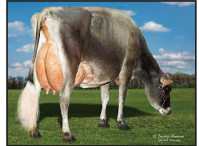
AHLEM CHEKELO BLUSH 47526 Dam of Lot C

AHLEM VOLCANO BUTTONS 42731 91% USA 072720947 GT8K BBR 100 JH1F JNSF TATTOO /A42731