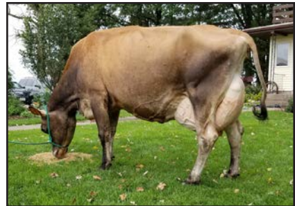
GM SANDHILL MAUI PRECIOUS {6} Dam of Lot 8B