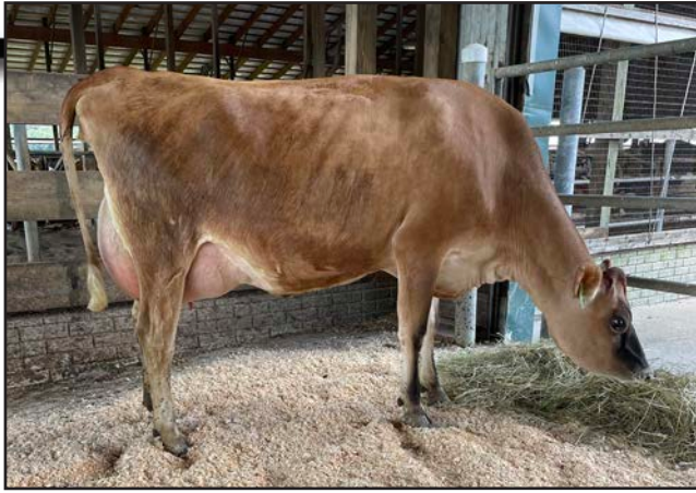
JX ROC-BOT CHIEF 12620 {4}-P Dam of Lot 4