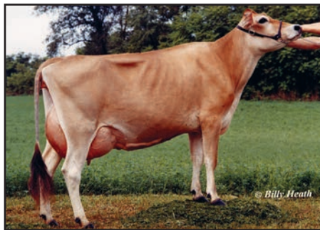
Reich-Dale Future Sierra, E-90% 2-9 305 19,410 5.2% 1,008 3.7% 716 Sold in 2005