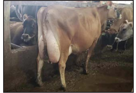
JX ROC-BOT LISTOWEL 9158 {5}-P Grandam of Lot 2

4TH DAM: JX ROC-BOT CHRONICLE 6856 {3} 68% 1-07 288 2 17550 4.1 711 3.3 579 95DCR 1937C