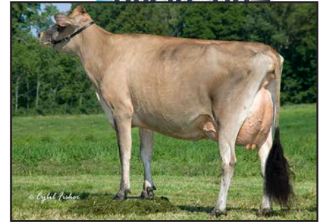
Kimbles Flora, E-91% 4-1 305 21,070 4.5% 956 3.1% 647 Sold in 2008