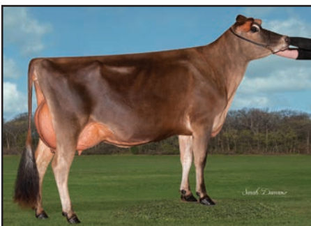
Mead-Manor Tequila Pryia, E-91% 3-0 305 20,390 4.9% 1,000 3.7% 751 "Peaches" is sister to her dam | Sold in 2015