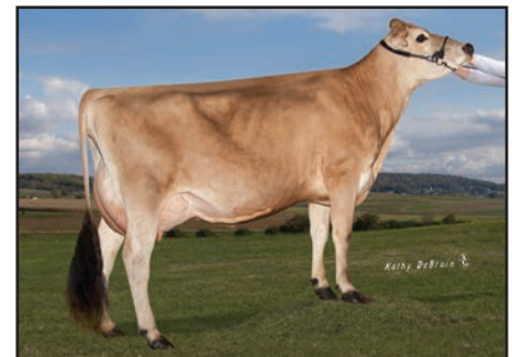
JX TLJ Visionary Bree {4}-ET, E-91% 3-8 305 3x 25,830 4.3% 1,098 3.3% 852 Sold in 2014