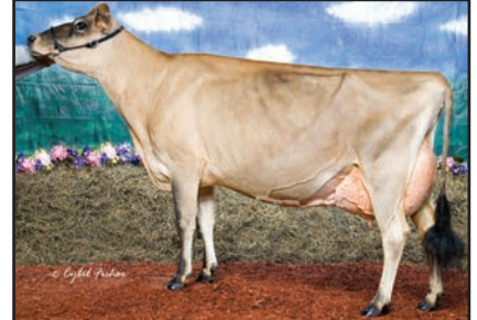
LLOYN JUDE GRIFFEN-ET Fourth Dam of Lot 13