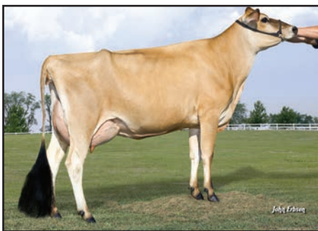
Unique HP Action Sasha-ET, E-90% 5-3 305 19,610 4.4% 870 3.8% 737 Sold in 2012