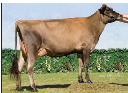
Senn-Sational Iatola Petrina, VG 89 (CAN) 3-9 305 18,664 4.3% 837 3.8% 751 Sold in 2008