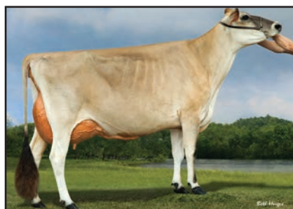
WOODMOHR DEAR FEVER-ETW Sister of Dam of Lot 12