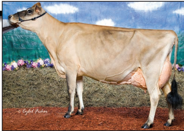
LLOLYN JUDE GRIFFEN-ET, E-95% Fifth Dam of Lot 1