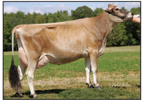
Flambeau Manor F Candance, E-93% 4-4 301 20,700 3.9% 814 3.1% 633 Sold in 2005