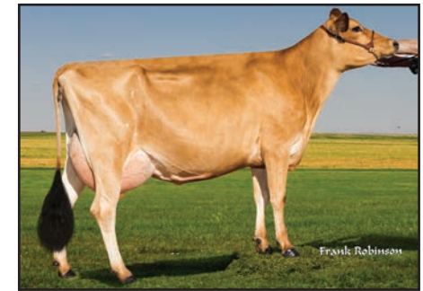
JX Ahlem Badger Carol 45700 {4}-ET, VG-84% 4-6 305 2x 19,790 5.1% 1,003 4.0% 790 Sold in 2016