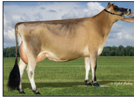
Camille Nevada of Edgebrook, E-91% 5-0 288 19,270 5.2% 999 3.7% 715 Sold in 2010