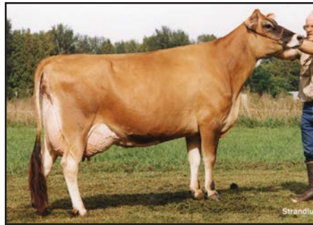
Willavals Lucky Lady, E-93% 3-6 305 19,780 3.8% 745 3.6% 705 Sold in 1997