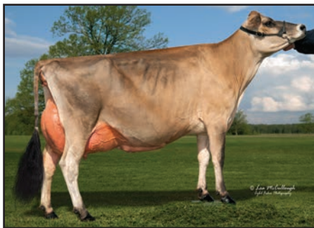
Edgebrook Shyster Chelsea 43, VG-88% Sold in 2014