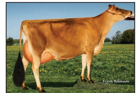
Mead-Manor Premier Penny, VG-86% Daughter of "Peaches" Sold in 2018