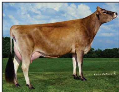
AHLEM VIABULL VANITY 5057-P Grandam of Lot B

CDCB GPTA S 09/06/2022 ORECS 74%R 99%ILE 10M 0.19% 41F 0.09% 20P 533CM$ 517NM$ 418FM$ 4.5PL 2.3LIV 1.9DPR 2.0CCR 1.8HCR 2.77SCS 508GM$ 0.1MFV 0.2DAB 0.1KET 0.7MAS 0.5MET 0.0RPL 3.43HTI AJCA 09/06/2022 GPTAT 77%R 0.3 GJUI 6.0