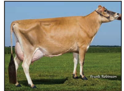
AHLEM VALENTINO BLUSH 38502 Great-Grandam of Lot C

VALSIGNA MARVEL CHEKELO USA 118506982 GT80K BBR 100 JH1F JNSF 11JE1207 CDCB GPTA S 08/01/2022 1183DAUS 71HRDS 3%RIP 99%R 264M 0.07% 28F 69%ILE 99%R 0.06% 23P 368CM$ 355NM$ 276FM$ 349GM$ 3.3PL 2.4LIV 2.0DPR 3.4CCR 4.1HCR 2.74SCS 0.2MFV 0.1DAB 0.0KET 0.6MAS 0.8MET 0.0RPL 3.78HTI AJCA 08/01/2022 675DAUS GPTAT 99%R 0.5 GJUI -2.9 GJPI 97%R 99