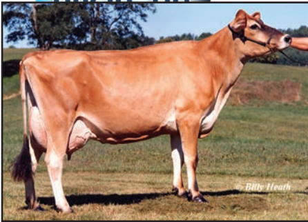
Twin Haven Berretta Linda, E-95% 6-1 305 24,540 4.8% 1,179 3.8% 928 Sold in 1997