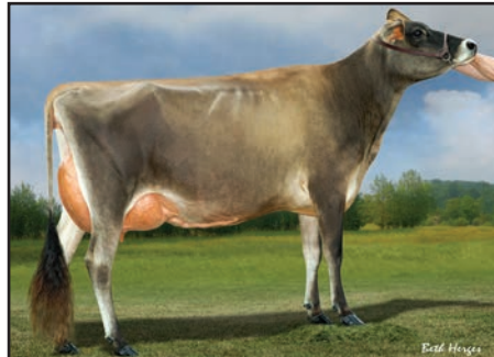
Woodmohr Jamaica Mystery, E-90% 1-11 301 16,160 5.1% 832 3.4% 543 Sold in 2014