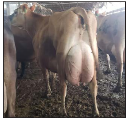
JX ROC-BOT LISTOWEL 9158 {5}-P Grandam of Lot 2