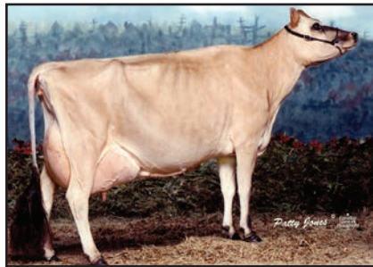
GLENAMORE GOLD PRIZE Fifth Dam of Lot 10