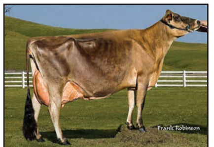
FAMILY HILL G FAITH FLIRT Grandam of Lot 9