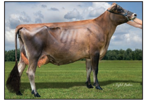
Klus-Grove Shoutout Capresha, VG-87% 1-11 287 13,180 5.0% 655 3.7% 492 Sold in 2019