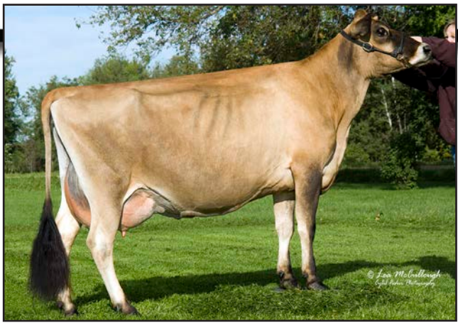
ENSIGN IACOCCA PRINCESS PRICILLA {3}, E-92% Fourth Dam of Lots 8A and 8B