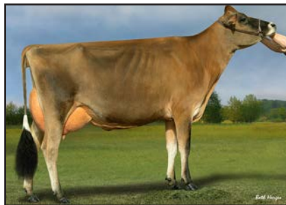
WOODMOHR GENTLE GINNY-ET From the Same Family