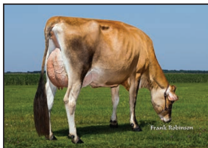
AHLEM TITAN VANITY 1245 From the Same Family as Lot 7