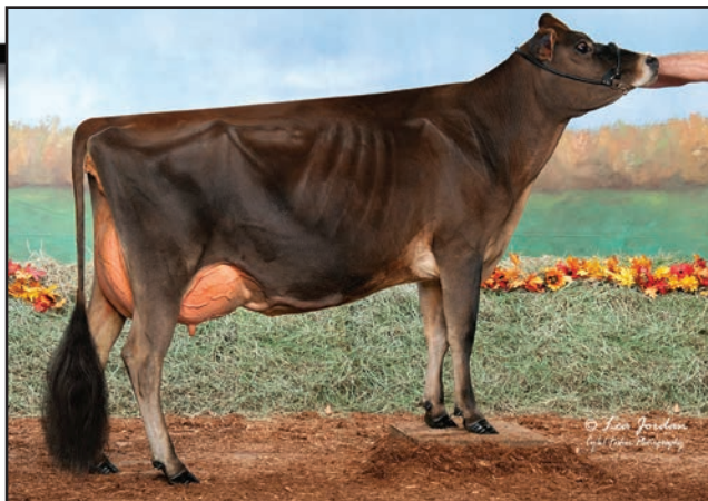
BILLINGS TEQUILA SERENA, E-92% Grandam of Lot 14