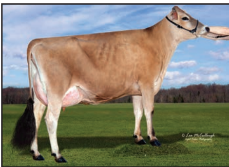
Ahlem Topeka Maid 40527-ET, E-91% 3-2 305 17,680 5.2% 921 3.7% 650 Sold in 2013