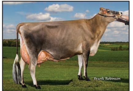
CLAQUATO VERBATIM FIREFLY-ET Sister to the Dam of Lot 9