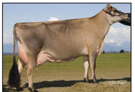
FAMILY HILL SD FAVORITE Fourth Dam of Lot 9