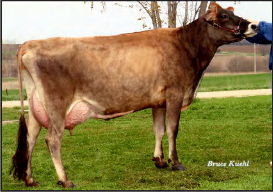
HEARTLAND MANNIX TYME, E-92% FOURTH DAM OF LOT 22