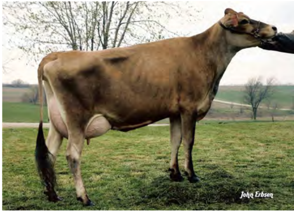
HEARTLAND IMPULS DONNA-ET, VG-85% FOURTH DAM OF LOT 15