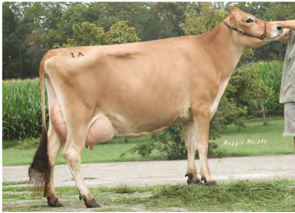
GABYS IMPULS DIANE-ET, VG-85% SISTER TO THE GRANDAM OF LOT 103B