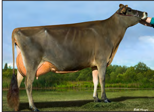
ARETHUSA SOCRATES VIBE-ET, E-93% GRANDAM OF LOT 9