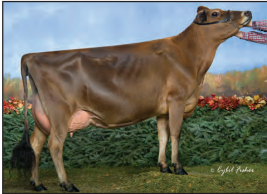
RATLIFF JURISDICTION MICKI, E-91% SISTER TO THE GRANDAM OF LOT 104A