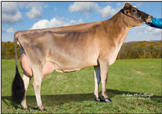
RATLIFF SAMBO MARCIA, E-92% GREAT-GRANDAM OF LOT 104A