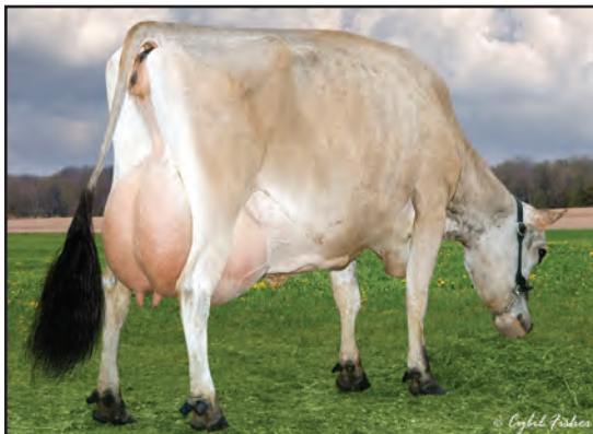
AHLEM B JOHN PRINCESS 3183-ET, E-91% FOURTH DAM OF LOT 13