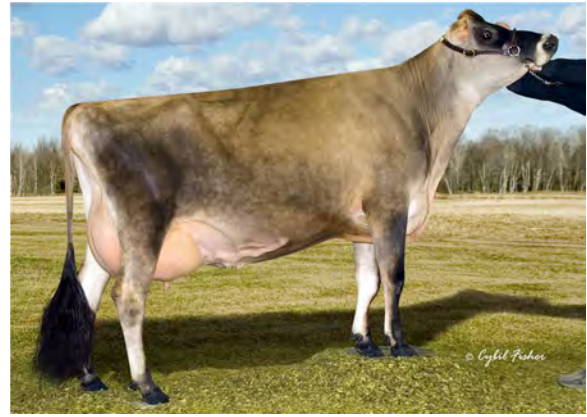
RI-JUL DELUXE NATALIE-TWIN, E-91% FOURTH DAM OF LOT 103C