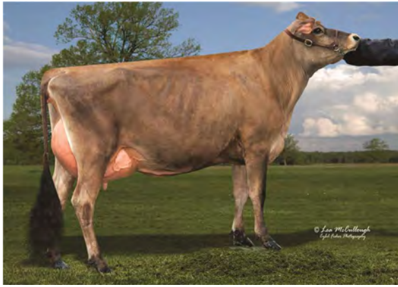
MILK-N-MORE TEQUILA NAOMI, E-93% DAM OF LOT 103C