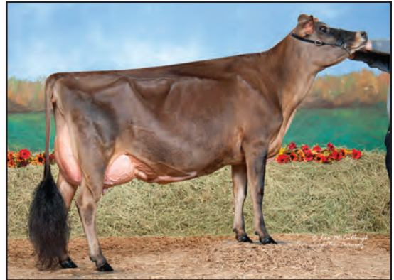
RATLIFF REMAKE MORGAN-ET, E-90% SISTER TO THE GRANDAM OF LOT 104A