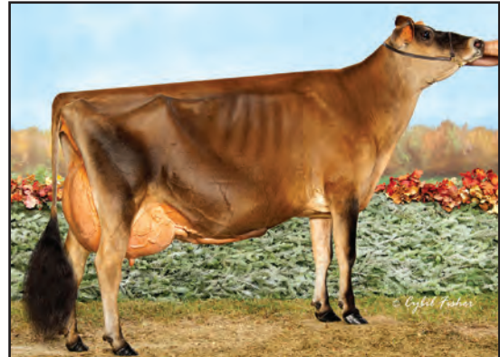
ARETHUSA HG VICTORIA-ET, E-94% SISTER TO THE GRANDAM OF LOT 9