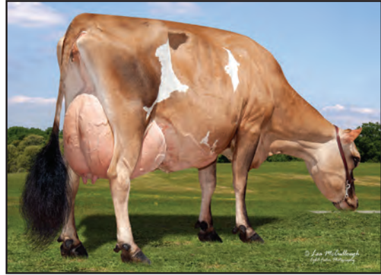
HEARTLAND NATHAN TEXAS-ET, E-95% SISTER TO THE GRANDAM OF LOT 22