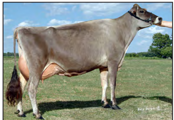
RATLIFF JADE MAISY-ET, E-94% FOURTH DAM OF LOT 104A