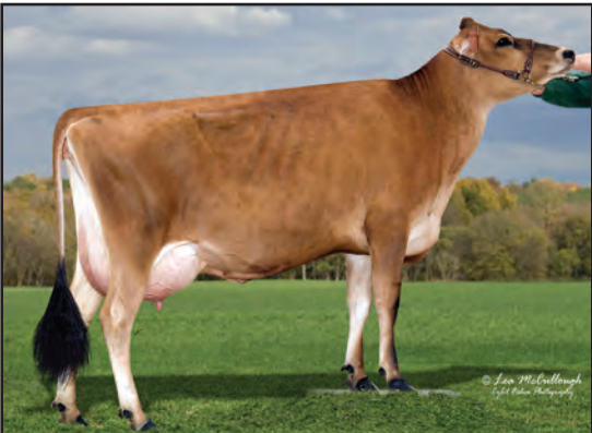
HEARTLAND JIMMIE TUCSON-ET, E-91% SISTER TO THE DAM OF LOT 22