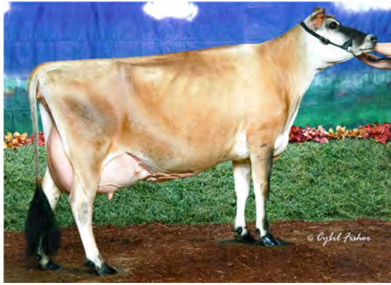
GIL-BAR REMAKE PATRICE, E-93% DAM OF LOT 200