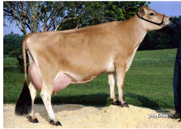
GABYS JACINTO DEMA, E-91% GREAT-GRANDAM OF LOT 103B