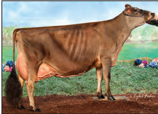
ARETHUSA RESPONSE VIVID-ET, E-96% GREAT-GRANDAM OF LOT 9