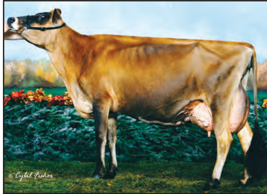
JADES JEWEL OF PARADISE (6), E-94% SISTER TO LOT 21