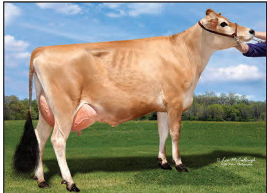
HEARTLAND IMPRESS TAMPA-ET, E-91% SISTER TO THE DAM OF LOT 22