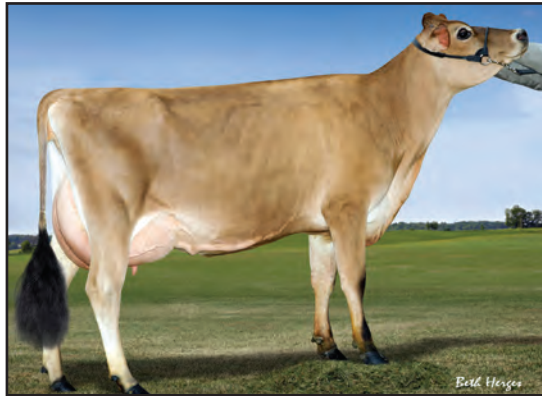
WAUNAKEE LEGAL PUFF-ET, E-90% SISTER TO THE GRANDAM OF LOT 13