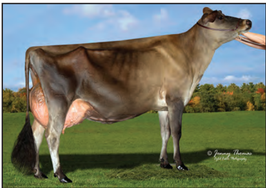
ARETHUSA IMPRESSION VILLENEUVE, E-93% SISTER TO THE GRANDAM OF LOT 9