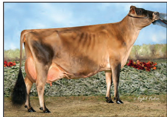
HURONIA CENTURION VERONICA 20J, E-97% FOURTH DAM OF LOT 9