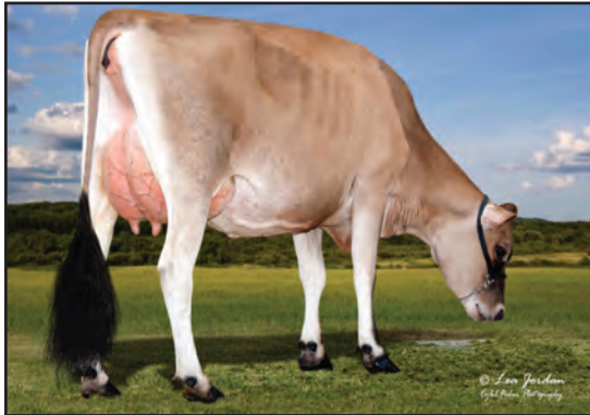
JX PVF PROP JOE ZAP {4}-ET, VG-83% SISTER TO THE DAM OF LOT 1B