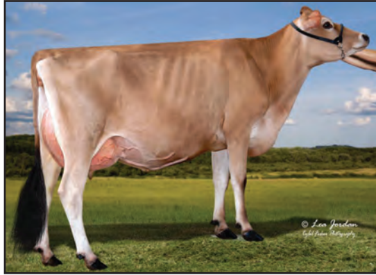
JX PVF PROP JOE ZIP (4)-ET, VG-85% SISTER TO LOT 1A