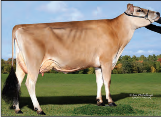
HEARTLAND FASTRACK TEMPE-ET, VG-88% DAM OF LOT 22