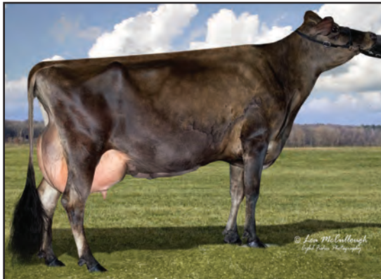
THOMSEN 4226 CADILLAC JAY (5), E-95% DAM OF LOT 21