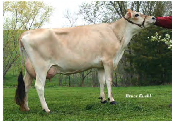
HEARTLAND MANNIX DOVE FIFTH DAM OF LOT 15