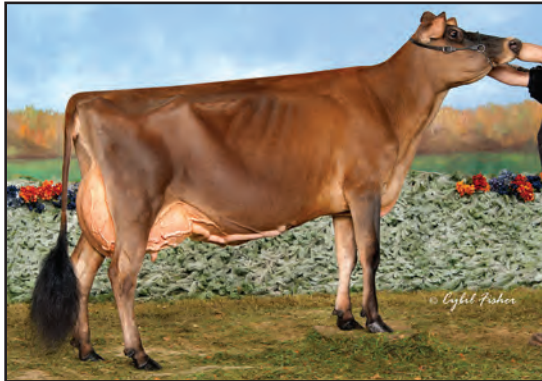
DEMERS JADE JEMINI (6), E-94% SISTER TO LOT 21