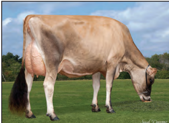
CLARESHOE ALLSTAR ZOOM ZOOM E-91% GRANDAM OF LOT 1B