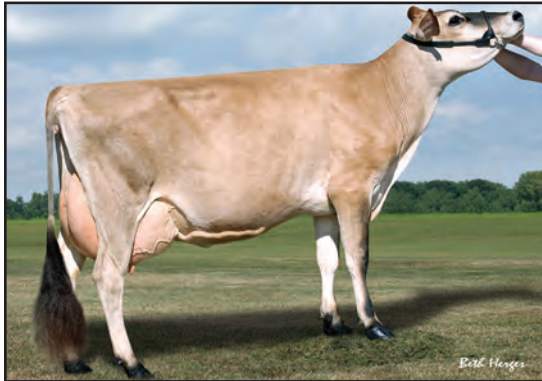
WAUNAKEE JEVON PROMIS 2058, VG-86% GREAT-GRANDAM OF LOT 13