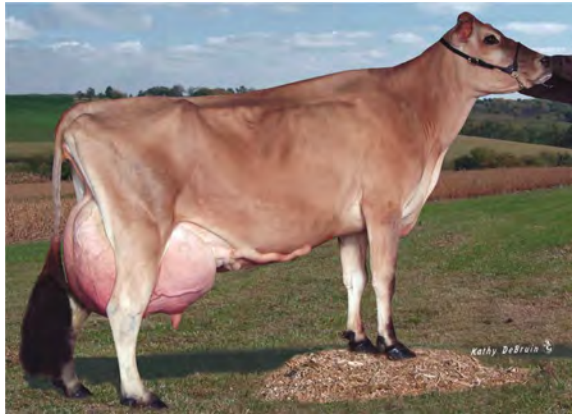
NORSE STAR JUDE BERRY, E-92% FOURTH DAM OF LOT 104D