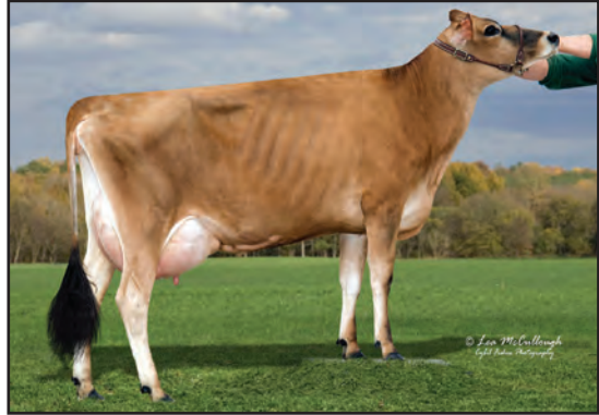
HEARTLAND JIMMIE TENNESEE, VG-88% SISTER TO THE DAM OF LOT 22