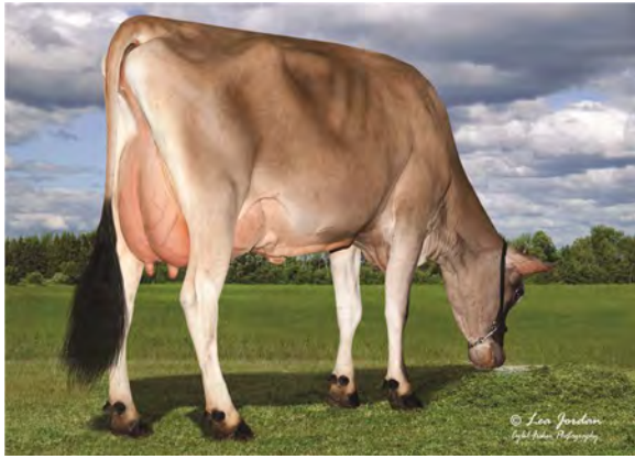
CINNAMON RIDGE AXIS CHOCOLATE-ET, VG-83% DAM OF LOT 108A