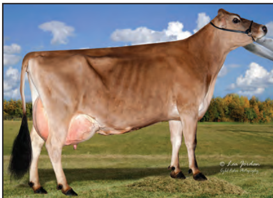
CINNAMON RIDGE DIMENSION BLESSED-ET, VG-84% SISTER TO THE DAM OF LOT 108B