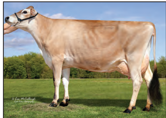
CINNAMON RIDGE DIMENSION AMEN-ET, VG-83% SISTER TO THE DAM OF LOT 108B