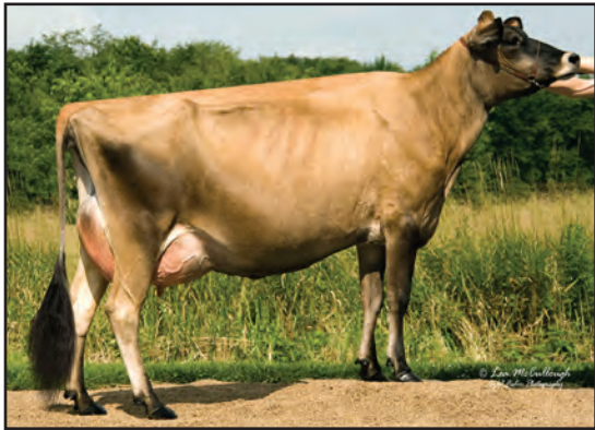
ARETHUSA VERONICAS VIXEN-ET, E-92% FOURTH DAM OF LOT 108H