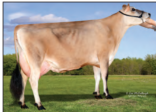
CINNAMON RIDGE VISIONARY CHARITY-ET, VG-88% SISTER TO THE DAM OF LOT 108B