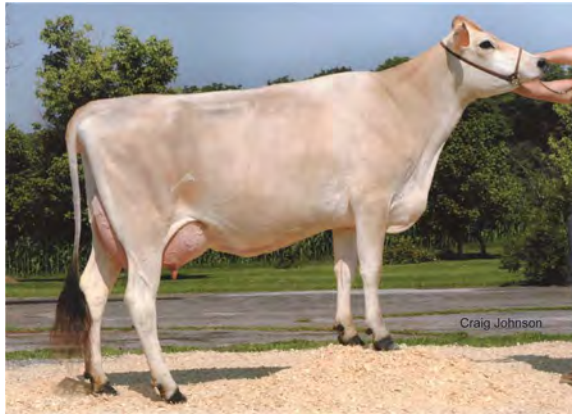
GABYS NAVARA SONG, E-91% GREAT-GRANDAM OF LOT 4