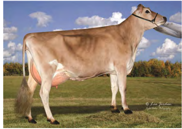
CINNAMON RIDGE NITRO PEPPERMINT-ET, VG-87% SISTER TO THE DAM OF LOT 108A