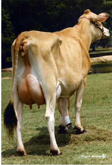
SENN-SATIONAL TRADER ELLENER, VG-88% FROM THE SAME FAMILY AS LOT 1