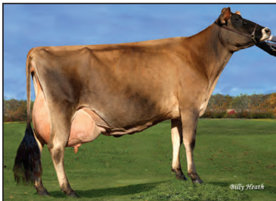
STONEY POINT VINDICATION FEEBEE-ET, E-92% SISTER TO THE GRANDAM OF LOT 13