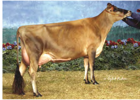
JULIANNAS DELUXE JUSTINE-ET, E-93% FOURTH DAM OF LOT 107C