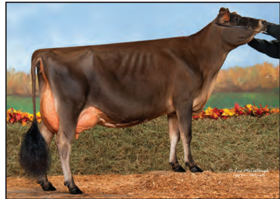
ELLIOTTS FAXON COMICAL-ET, E-91% FROM THE SAME FAMILY AS LOT 104E