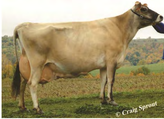
TY-LY-VIEW GG GRACIE, E-90% FIFTH DAM OF LOT 106B