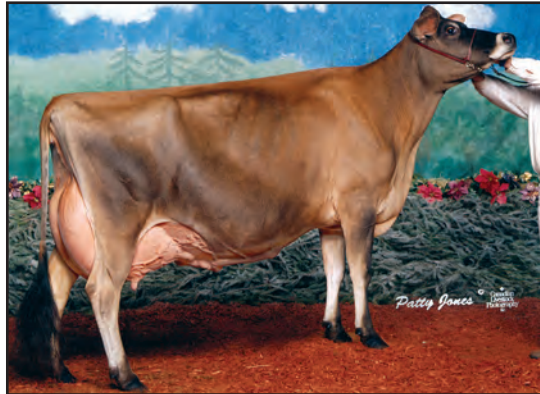
JIF LITTLE MINNIE, EX 96-2E (CAN) FOURTH DAM OF LOT 106C