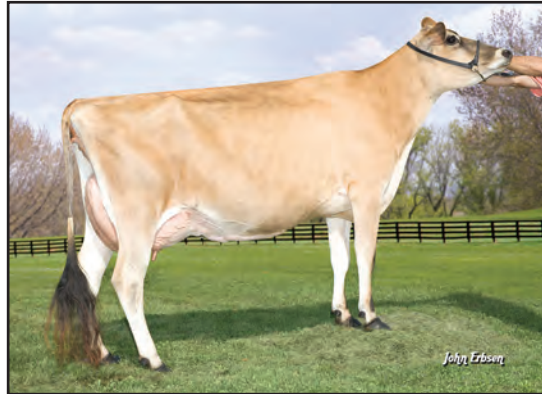
WF COUNCELLER ANAKORNIKOVA-ET, E-93% GRANDAM OF LOT 6