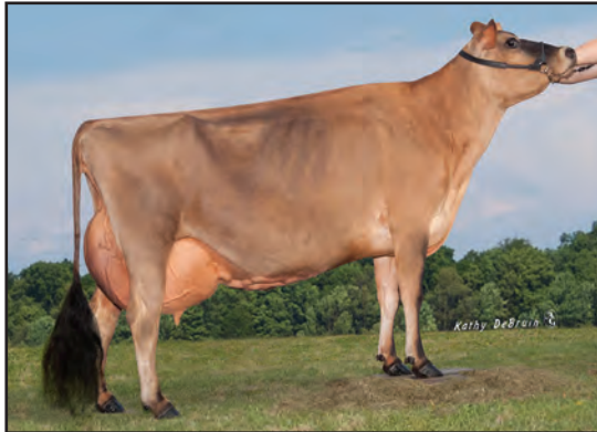
STONEY POINT VINDICATION FIFI, E-93% SISTER TO THE GRANDAM OF LOT 13