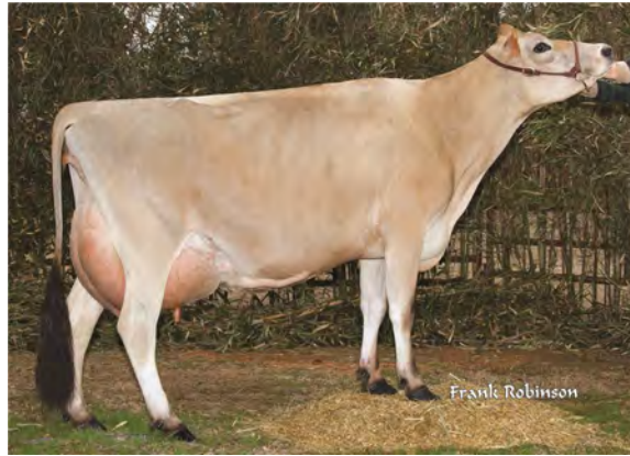
JACES MELINDA, E-92% FOURTH DAM OF LOT 1130