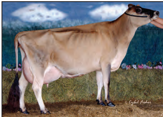
GIPRAT RENN ANASTASIA-ET, E-95% GREAT-GRANDAM OF LOT 6