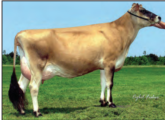
SHF SAMBO FUSCHIA, E-92% GRANDAM OF LOT 13