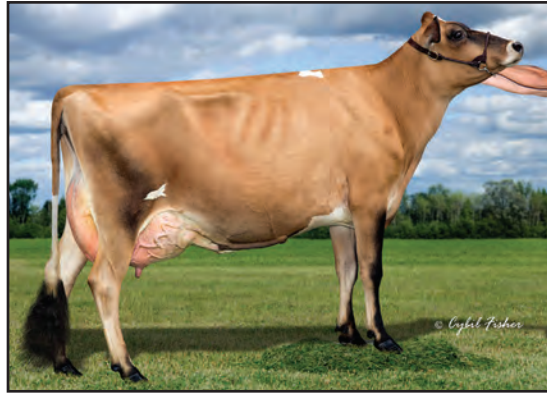
ARETHUSA SUREFIRE VIRGINIA-ET, E-92% GREAT-GRANDAM OF LOT 108H