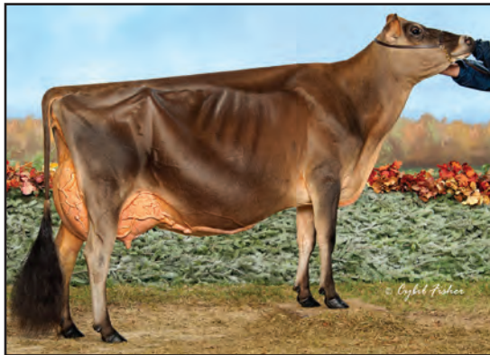
ELLIOTTS BLACKSTONE CHARLOTTE-ET, E-94% FROM THE SAME FAMILY AS LOT 104E