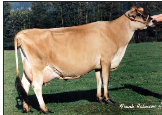
STARHEART DUNCAN ALPHA, EX-2E (CAN) FIFTH DAM OF LOT 6