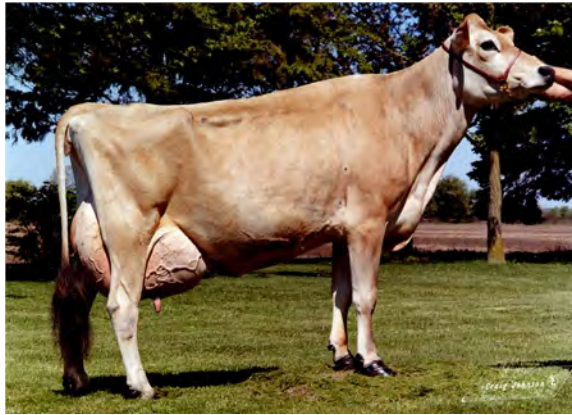
SUNNY DAY BOLD BELINDA-ET, E-94% FIFTH DAM OF LOT 103B