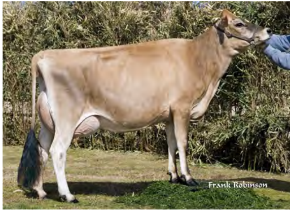
CHAIRMAN GENNIE, E-90% SISTER TO THE GRANDAM OF LOT 108C