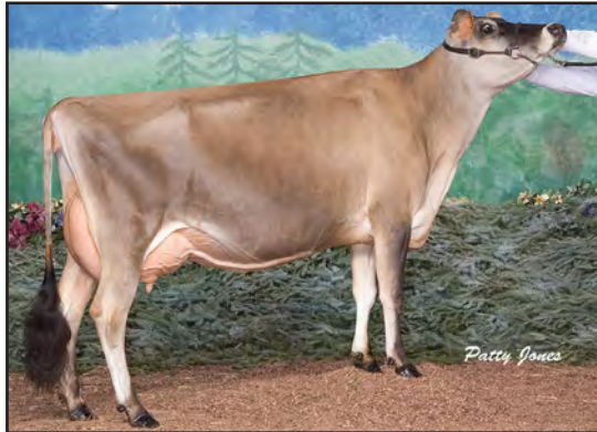
SELECT-SCOTT JW COVERGIRL-ET, EX 90-2E (CAN) GREAT-GRANDAM OF LOT 106C