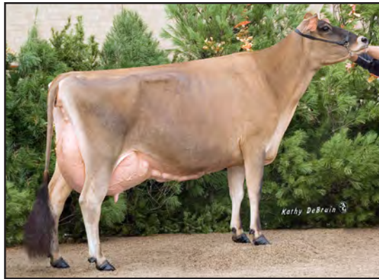
GCJ JADE VARSITY, E-93% SISTER TO THE GRANDAM OF LOT 111K