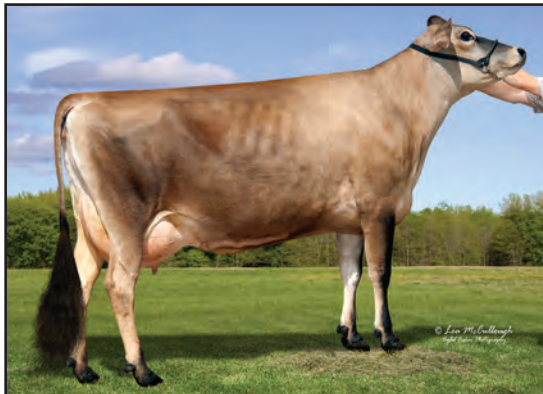
CINNAMON RIDGE PREMIER PEACE-ET, E-90% SISTER TO THE DAM OF LOT 108B