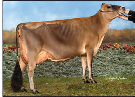
ELLIOTTS COSMO ACTION-ET, E-93% FROM THE SAME FAMILY AS LOT 104E