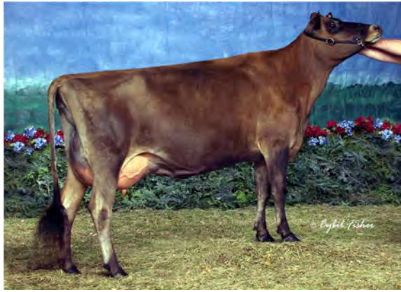
HOMERIDGE F P LISA 2, E-92% FOURTH DAM OF LOT 108G