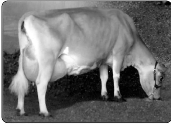
PINES PRAIRIES FANCY {1}, E-92% GREAT-GRANDAM OF LOT 2