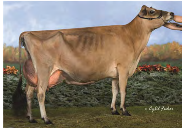
STORA OF OBLONG VALLEY, E-94% FROM THE SAME FAMILY AS LOT 106A