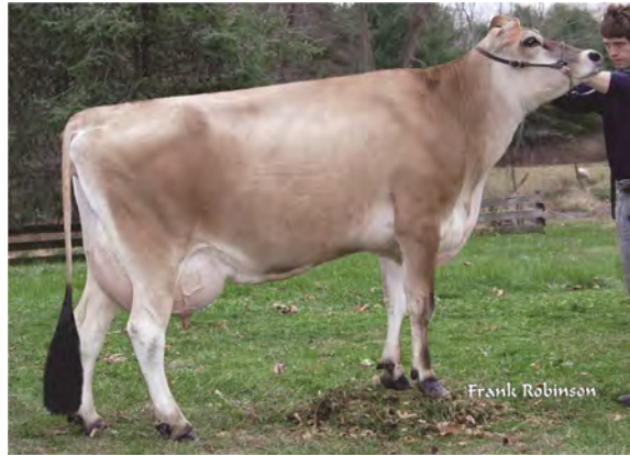
CELESTIAL FANCLUB FORTRESS, E-90% FIFTH DAM OF LOT 103F