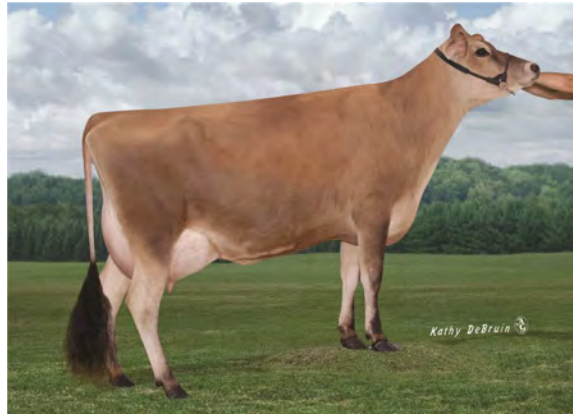
DODAN LH VISIONARY TESSA, E-90% SISTER TO THE GRANDAM OF LOT 5