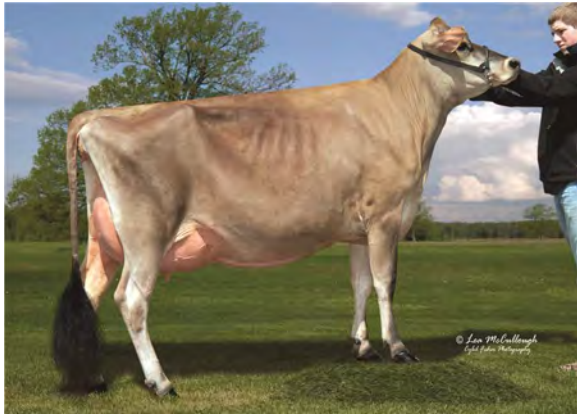
AVON ROAD REAGAN SPRING-ET, E-93% SISTER TO THE GRANDAM OF LOT 106D