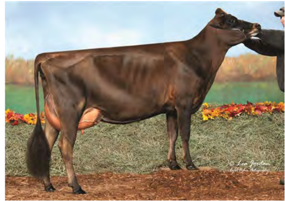
PINE PRAIRIE OLIVER FIESTA {5}, E-91% FROM THE SAME FAMILY AS LOT 2