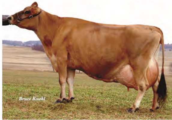
AVON ROAD DC POP, E-93% FOURTH DAM OF LOT 107D