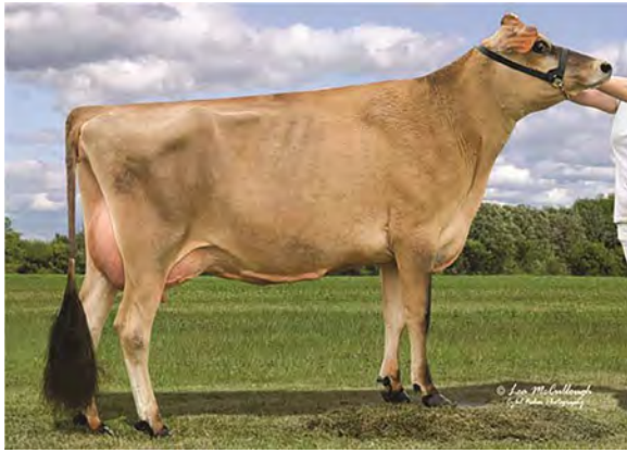
JUSTINES CGAR JOLLY-ET, E-92% GREAT-GRANDAM OF LOT 107C