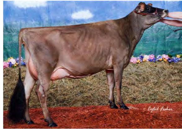
OBLONG VALLEY DE SPRIG-ET, E-94% GREAT-GRANDAM OF LOT 106D