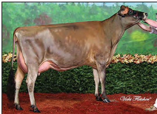
SELECT-SCOTT SALTY COCOCHANEL, EX 94-2E (CAN) SISTER TO THE GRANDAM OF LOT 106C