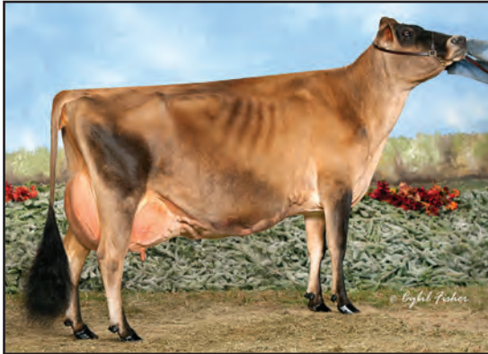
HURONIA CENTURION VERONICA 20J, E-97% FOURTH DAM OF LOT 104E