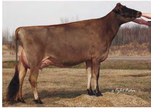
BURLIN STARS N STRIPES, E-92% GREAT-GRANDAM OF LOT 7