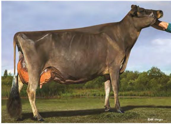
STARS SEQUEL-ET, E-94% GRANDAM OF LOT 7