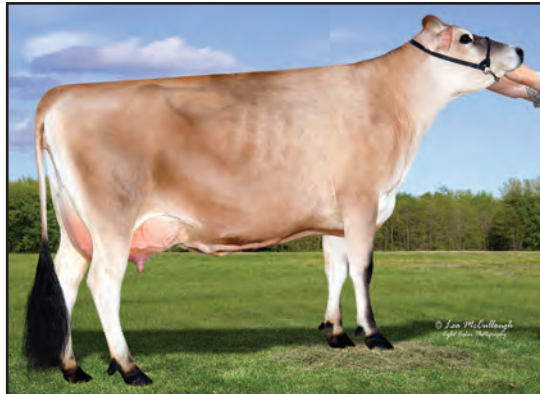
CINNAMON RIDGE VISIONRY CHASTITY-ET, VG-84% DAM OF LOT 108B