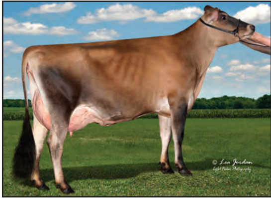
NORWAY MAPLE ALLSTAR VENTI, VG-82% GRANDAM OF LOT 108H