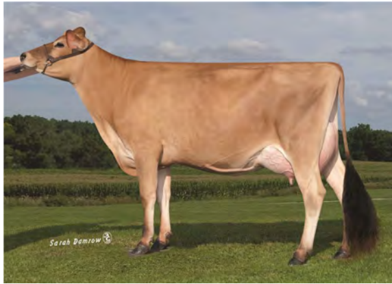
HEI-BRI ZAYD IZNOT {5}, VG-86% SISTER TO THE GRANDAM OF LOT 1111