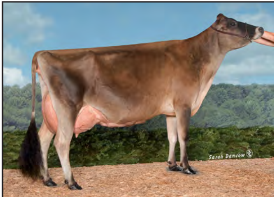
SHERONA MINISTER ANGEL, E-94% SISTER TO THE DAM OF LOT 6