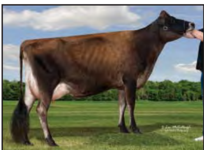
OAKFIELD TBONE VANESSA-ET Sister to the Dam of Lot 52