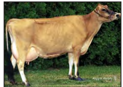
FRIENDLY VALLEY BRTTA STARBRIGHT, E-92% Sixth Dam of Lot 37

4TH DAM: FRIENDLY VALLEY SAMBO STARLY {6} 90% 6-06 305 2 21070 4.8 1005 3.5 738 95DCR 2551C