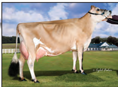
RIVER VALLEY CARRIER SALINA III-ET Sister to the Dam of Lot 60