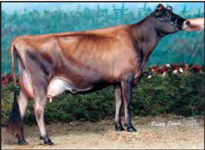
JASPAR RENAISSANCES EVENING Sister to the Dam of Lot 8