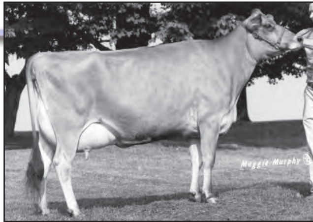
EMPIRE M. WILLOW OF SSF, E-90% Fourth Dam of Lot 6