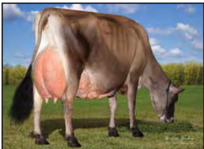
OAKFIELD TBONE VIVIANNE-ET Dam of Lot 52