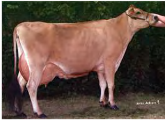
DREAMROAD VIKING SPUNKY, E-94% FOURTH DAM OF LOT 105A