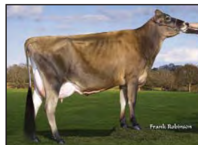
JX DEN-KEL JAMBOREE {3}-ET Sister to the Grandam of Lot 13