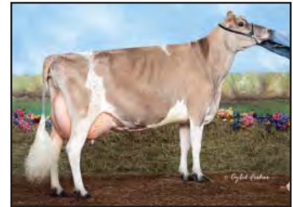
FAIR FUROR TRIX Dam of Lot 19

RAPID BAY GUNMAN-ET JECAN000107536364 91JE5475 CDCB PTA 04/01/2017 25DAUS 15HRDS 44%RIP 74%R -1669M 0.27% -31F 0%ILE 76%R 0.05% -51P -343CM$ -332NM$ -312FM$ -277GM$ -1.5PL 0.4DPR 1.2CCR 2.5HCR 3.29SCS AJCA 04/01/2017 17DAUS PTAT 61%R 1.3 JUI 23.1 JPI 58%R -98