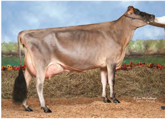
DREAMROAD IATOLA CARLETTA, E-93% GREAT-GRANDAM OF LOT 105C