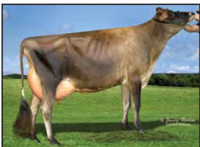
OAKFIELD MINISTER VENICE-ET Sister to the Dam of Lot 52