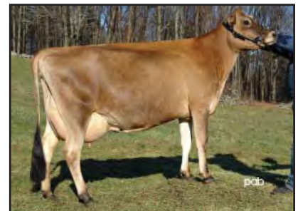
PEARLMONT IMPULS DAFFY Fourth Dam of Lot 31