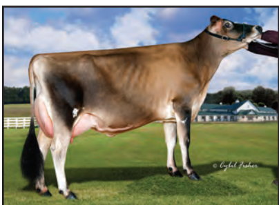
RIVER VALLEY VALENTINO SALINA I-ET Sister to the Dam of Lot 60