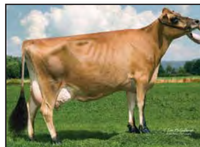
DEN-KEL IMPULS JULIE TOO Great-Grandam of Lot 13