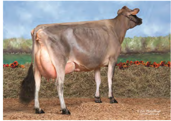
DREAMROAD IATOLA CARLETTA, E-93% GREAT-GRANDAM OF LOT 105C