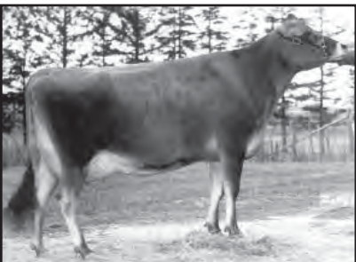
ELMLINE TITLES ELIZA 14R Great-Grandam of Lot 8

BORN 06/28/2015 TATTOO / S79 PO FEMALE EFI 3.7%