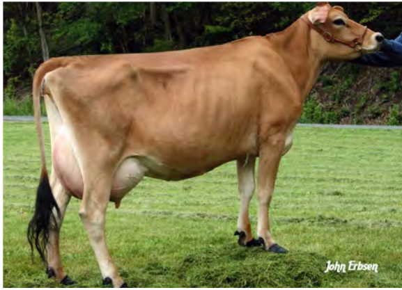
LAWTONS JACE SLIDE, E-90% SISTER TO THE DAM OF LOT 108