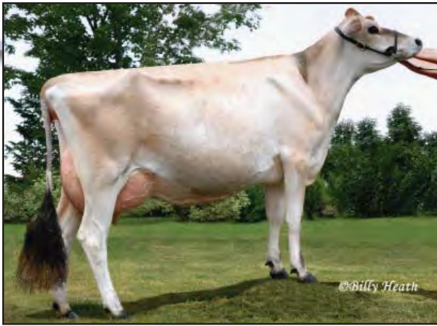
JETTAS BOMBER JAMIE-ET, E-91% Sister to the Grandam of Lot 41