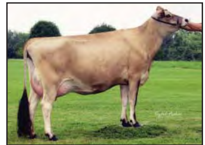
SPRING VALLEY JUDE JETTA Great-Grandam of Lot 41

SISTER(S): JETTAS DUAISEOIR JASMINE-ET 91% 3-02 301 2 12460 4.6 569 3.8 469 97DCR V 1561C JETTAS BOMBER JAMIE-ET 91% 7-02 305 2 19370 4.8 924 3.5 681 93DCR 2354C JETTAS FLAME JENNA 87% JETTAS VINDICATION JANE-ET 88% 3RD MILKING YEARLING, 2008 MID-ATLANTIC JR SHOW 4TH SR 2-YEAR-OLD, 2009 MID-ATLANTIC JR SHOW JETTAS FUROR JODY-ET 84% 3-01 305 2 15160 4.0 599 3.6 546 98DCR 1716C JETTAS JURIS JADA-ET 87% 5-07 305 2 15470 4.6 710 3.4 524 97DCR 1810C