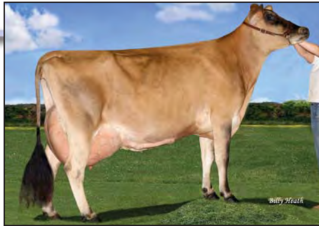
BW LEGION COED-ET, E-91% Fourth Dam of Lot 36