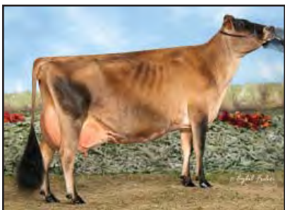
HURONIA CENTURION VERONICA 20J Great-Grandam of Lot 52