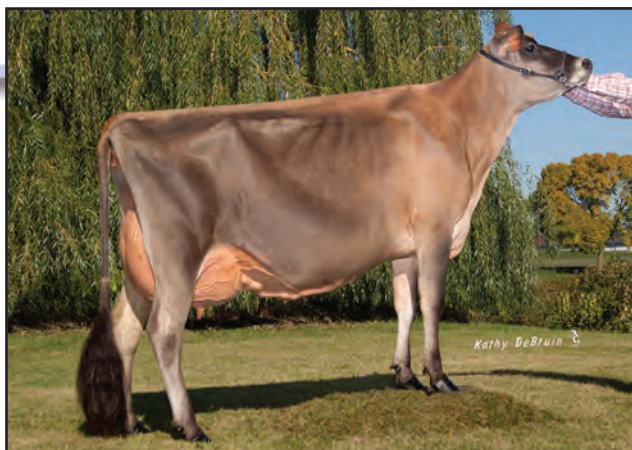
COWBELL GUAPO SNEAKERS, E-91% Sister to the Dam of Lot 12