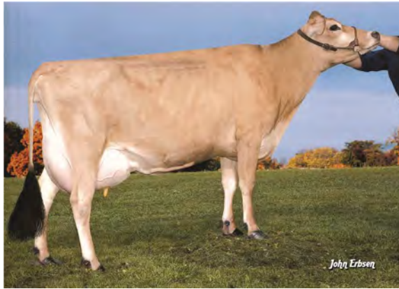
LAWTONS RESCUE FINESS, E-91% GREAT-GRANDAM OF LOT 113A