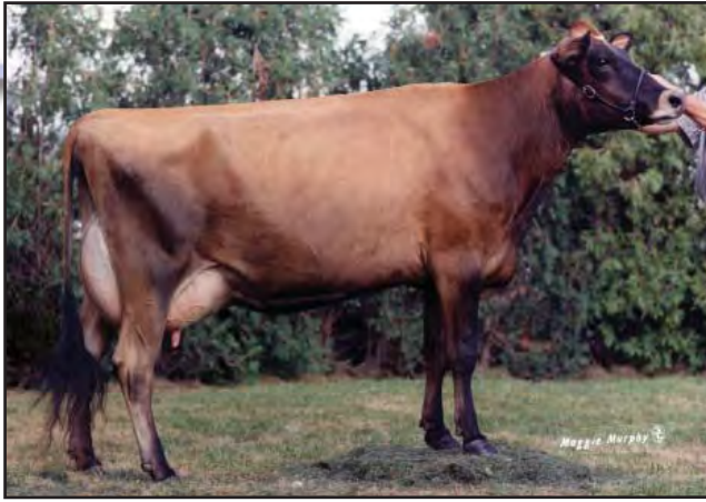
SS CHAMPIONS CONNIE OF SSF, E-90% Fourth Dam of Lot 1