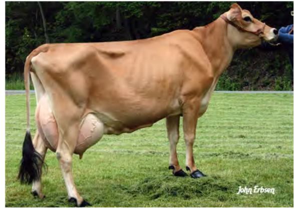
LAWTONS PARAMOUNT SLIP, E-92% GRANDAM OF LOT 108