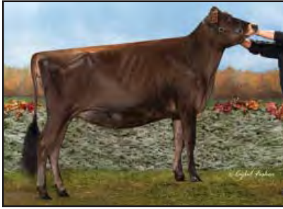
SSF TEQUILA FANTASIA Sister to the Grandam of Lot 2

BORN 04/29/2015 PO FEMALE EFI 5.0% AMERICAN ID 1559 / 1559