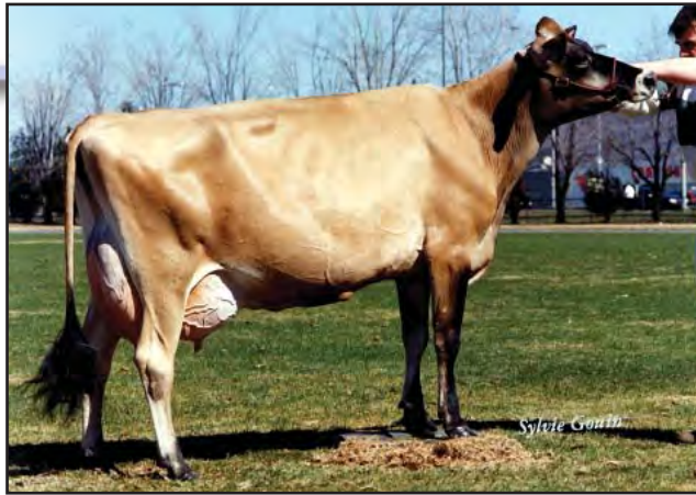
V JUNO JO, EX 94-4E (CAN) Fourth Dam of Lot 24