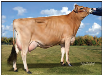
RIVER VALLEY CARRIER SALINA I-ET Sister to the Dam of Lot 60