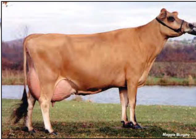
FRIENDLY VALLEY MOE STARLIGHT {5}, E-95% Fifth Dam of Lot 37