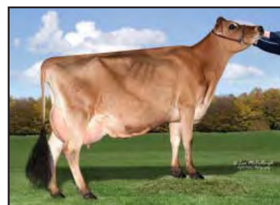
DEN-KEL JIGANTRESS-ET Sister to the Grandam of Lot 13