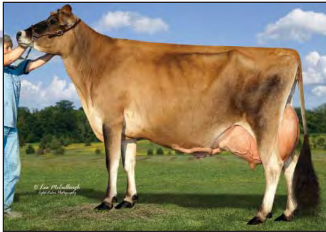
EDAN GOVERNOR SHIMMIE {6}, E-91% Sister to the Dam of Lot 20