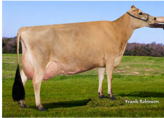
SEACORD FARM VALENTINO VENUS, E-90% SISTER TO THE GRANDAM OF LOT 113B