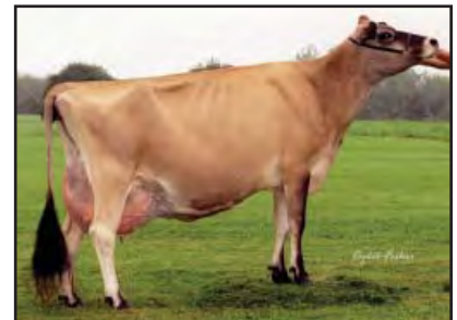
EDGEVIEW RENAISSANCE JANE 57 Fourth Dam of Lot 41