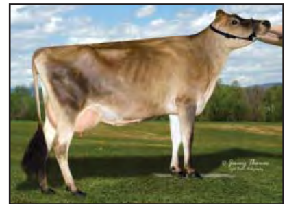
PEARLMONT VIBRANT SWEETHEART Grandam of Lot 31

4TH DAM: PEARLMONT IMPULS DAFFY 90% 4-03 305 2 18560 5.0 932 3.8 707 102DCR 2446C