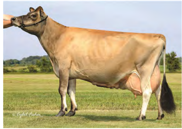
BILLINGS VIEW MORGAN, E-93% GREAT-GRANDAM OF LOT 103B