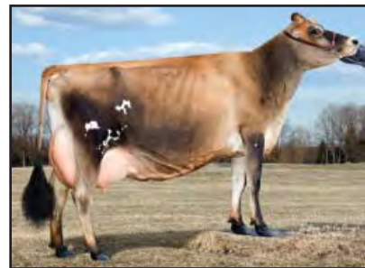
DEN-KEL SUGARDADDY JULIE THREE Grandam of Lot 13

4TH DAM: DEN-KEL LEMVIG JELLY-ET 92% 9-06 365 2 35300 4.7 1661 3.3 1165 101DCR 4024C