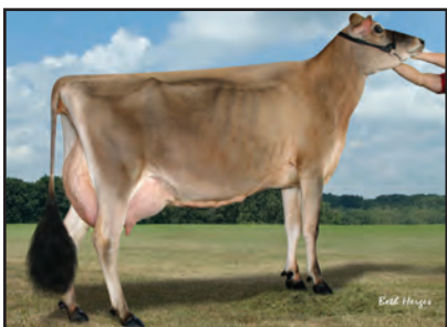
HEARTLAND ARTIST SALINA Grandam of Lot 60