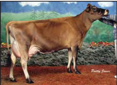
JASPAR RENAISSANCES ENVISION Sister to the Dam of Lot 8