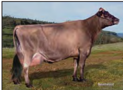
BW AVERY KATIE ET121-ET, E-93% Fifth Dam of Lot 36