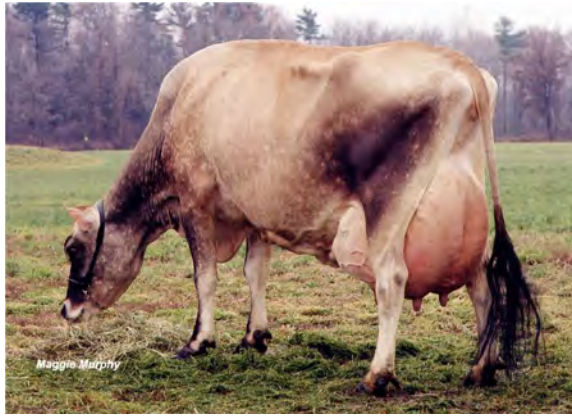
DUTCH HOLLOW B MASQUERADE-P, E-91% SIXTH DAM OF LOT 117C