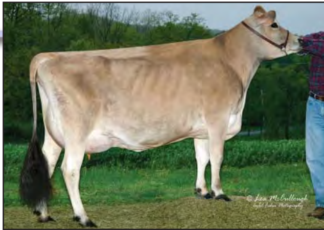
BELLVALE JACE TILLE, E-91% Grandam of Lot 30