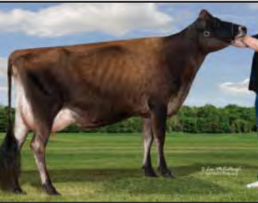
OAKFIELD TBONE VANESSA-ET Sister to the Dam of Lot 34

RICHIES JACE TBONE A364 USA 113672851 GT50K BBR 100 JH1F JH2F 7JE1000 CDCB GPTA 04/01/2017 18518DAUS 1704HRDS 6%RIP 99%R -224M 0.21% 31F 18%ILE 99%R 0.11% 13P 132CM$ 104NM$ 35FM$ 69GM$ -1.1PL -1.8DPR -1.4CCR 1.7HCR 3.12SCS AJCA 04/01/2017 10609DAUS GPTAT 99%R 1.1 GJUI 7.3 GJPI 99%R 39