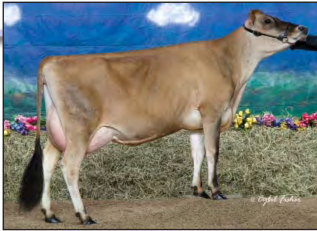
BILLINGS PERIMETER SYLVIA, E-93% Grandam of Lot 48