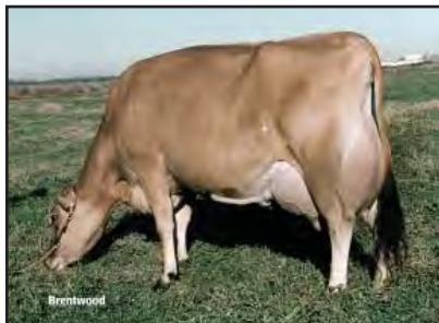
BW BERRETTA PRIZE G525, E-92% Sixth Dam of Lot 36