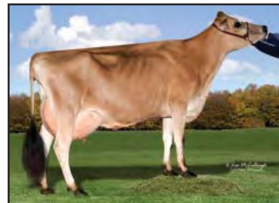
DEN-KEL JOAN-ET Sister to the Grandam of Lot 13