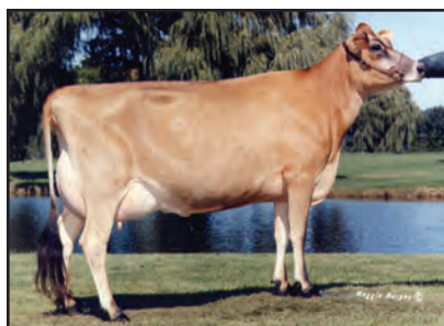
COWBELL IMPERIAL NESTLE, E-93% Fifth Dam of Lot 12