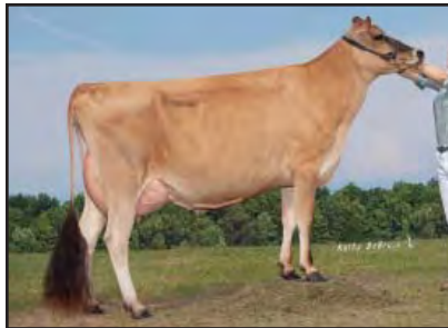
EDAN AWARD JITTERBUG {5} Grandam of Lot 20