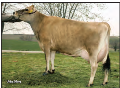
HEARTLAND JOHN SHANNON Great-Grandam of Lot 60