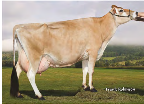
DAR VIEW LOUIE HOPE, E-91% SISTER TO THE GRANDAM OF LOT 106E