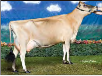
JASPAR R EVENING MOON-ET Dam of Lot 8