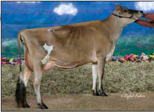
STONEY POINT BLACKSTAR BOE, E-91% Sister to the Grandam of Lot 51