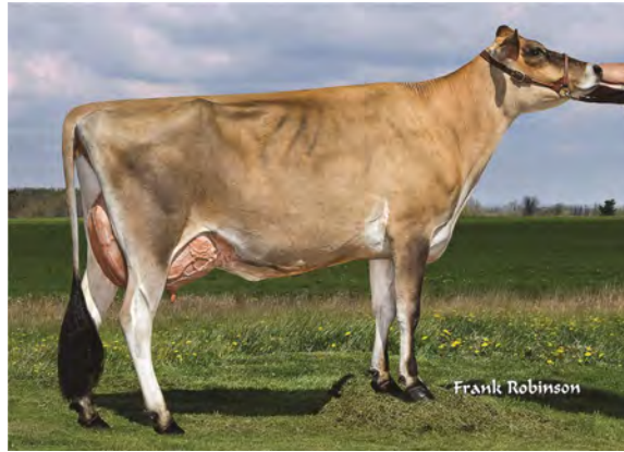
POSIE PAT OF SPRINGDALE, E-90% DAM OF LOT 104