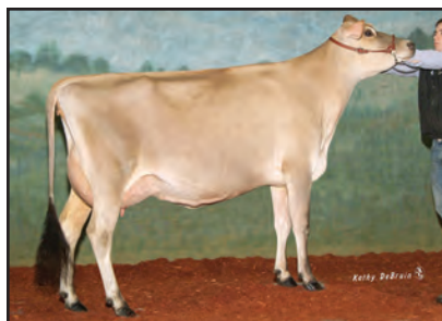
COWBELL SOCRATES NADINE Sister to the Grandam of Lot 12