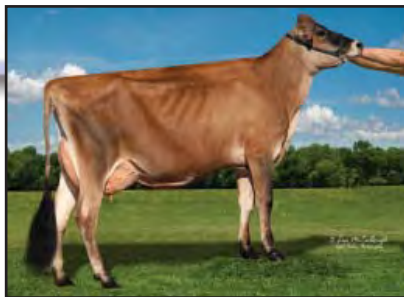
KEVETTA CELEBRITY VIVICA Sister to Lot 52