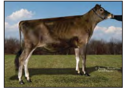
TIERNEYS HIRED GUN LAURA Dam of Lot 5

4TH DAM: TIERNEYS PERFECTION LANNI {4} 91% 2-11 305 2 14550 4.7 677 3.6 526 93DCR 1812C