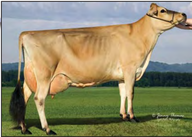
PEARLMONT VENERABLE SWEETNESS-ET, E-90% Dam of Lot 31