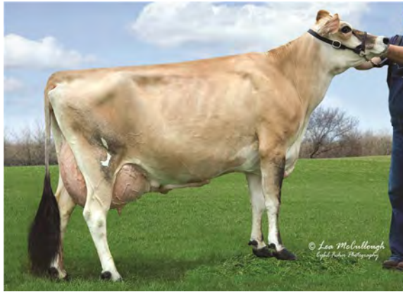
BILLINGS HALLMARK MELANIE, E-93% FOURTH DAM OF LOT 103A