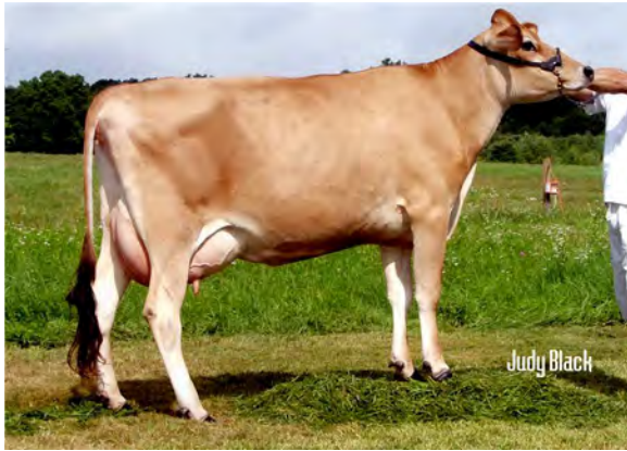
LAWTONS MANNIX FIZZ, E-91% SISTER TO THE GRANDAM OF LOT 115