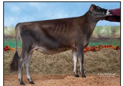
COWBELL GUAPO SLIPPERS, VG-87% Dam of Lot 47

COWBELL VINDICATION NIKE 90% USA 114880428 13K JH1F JH2F TATTOO 93C / 93C DHIA HERD # 21-39-0702 CONTROL # 1572 1-11 305 2 12930 5.3 679 3.7 473 95DCR 1636C 2-11 305 2 13740 5.5 755 3.8 526 98DCR 1820C 3-11 288 2 17220 5.5 946 3.6 625 97DCR 2161C 4-11 305 2 18990 4.9 934 3.7 697 98DCR 2410C 6-02 305 2 16650 4.0 662 3.6 603 98DCR 1897C 7-11 305 2 18810 5.0 944 3.5 650 96DCR 2246C 8-11 305 2 11950 4.9 585 3.8 457 96DCR 1570C 305 2X ME AVG 7L 16940M 840F 614P 2096C PPA -1922M -54F -53P / YD -2710M -84F -78P CDCB GPTA 04/01/2016 5RECS 80%R 6%ILE -1215M -44F -40P -175CM$ -170NM$ -157FM$ -120GM$ 2.2PL 1.8DPR 2.4CCR 2.3HCR 3.00SCS AJCA 04/01/2016 GPTAT 78%R -0.2 GJUI 7.4 GJPI 75%R -99