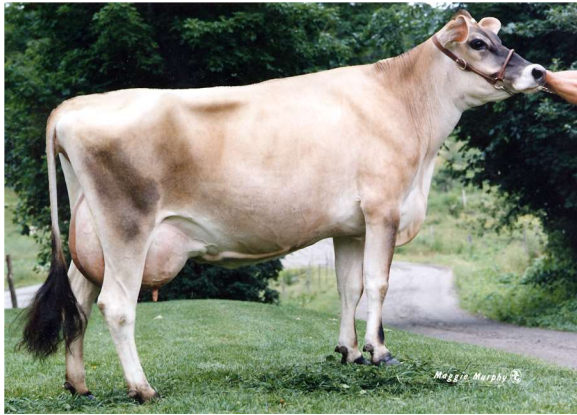
MOLLY BROOK SOONER FAME-ET, E-91% FIFTH DAM OF LOT 117B