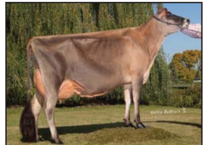
COWBELL GUAPO SNEAKERS, E-91% Sister to Dam of Lot 47

YELLOW BRIAR HEATHS GUAPO JECAN000103443735 70JE9950 CDCB PTA 04/01/2016 242DAUS 133HRDS 11%RIP 91%R -1978M 0.29% -42F 1%ILE 91%R 0.08% -56P -340CM$ -346NM$ -358FM$ -315GM$ 0.3PL 0.9DPR -0.5CCR -1.1HCR 2.99SCS AJCA 04/01/2016 119DAUS GPTAT 83%R 0.3 JUI 18.3 JPI 84%R -156