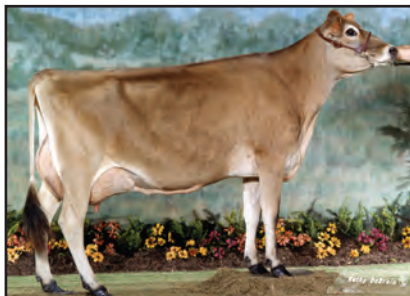
Chasin-Rainbows P Garnet, E-90% 4-3 305 20,350 4.2% 858 3.4% 697 Sold in the 1996 Sale