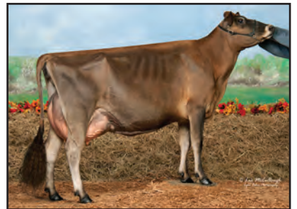
WF MOMENT ANALOU-ET Sister to Grandam of Lot 40A