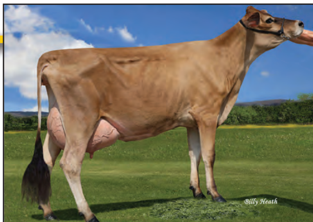
SCHULTZ CRITIC TONI, VG-82% Dam of Lot 29