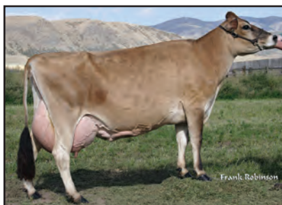
HAWARDEN MANNIX PIXY Sister to Grandam of Lot 10F