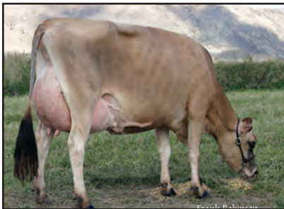
HAWARDEN FUTURE PIX Grandam of Lot 10D