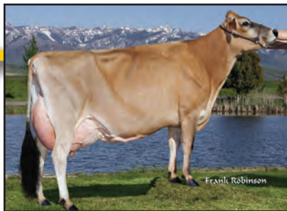
HAWARDEN JACE PIX Dam of Lot 10F (2011 photo)