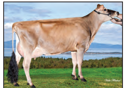
VERJATIN CELEBRITY LIZZIE-ET Sister to Grandam of Lot 3