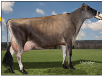
SHERONA MINISTER ANGEL Dam of Lots 40A-40G