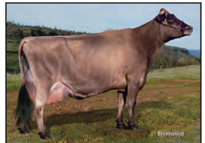
BW AVERY KATIE ET121-ET Fifth Dam of Lot 3