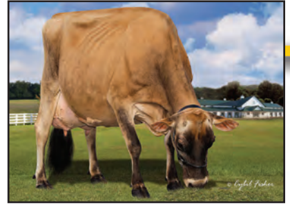
HAWARDEN JACE PIX Dam of Lot 10C