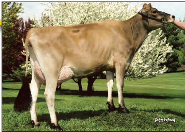
BOHNERTS JACE ACCLAIM, E-90% Great-Grandam of Lot 9