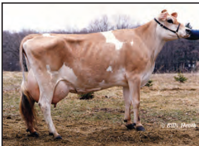
HOLLYROCK MARCUS JULIE Fourth Dam of Lot 23