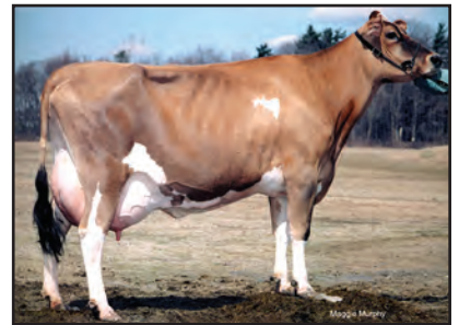
OA OOMSDALE GORDO GOLDIE GRATITUDE{1} Fourth Dam of Lot 30