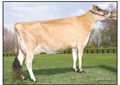
WF COUNCILLER ANAKORNIKOVA-ET Grandam of Lot 40A