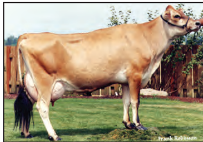
Wolf River Berretta Addie-ET, E-90% 2-0 305 3x 25,720 4.3% 1,106 3.7% 956 Sold in the 1996 Sale