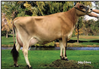
Nobledale Victorias Sydney-ET, E-90% 2-10 305 23,230 4.7% 1,087 3.6% 841 Sold in the 2004 Sale