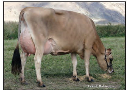
HAWARDEN FUTURE PIXY Grandam of Lot 10A