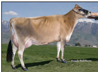
HAWARDEN JACE PIXY Sister to Dam of Lot 10F