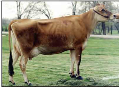
MAPLE LAWN ILL LEGEND THYME-ET Great-Grandam of Lot 33