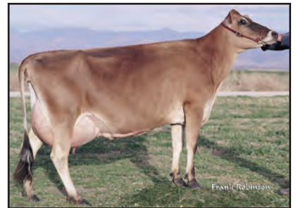
HAWARDEN MARKER PIXY Sister to Grandam of Lot 10A