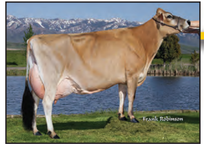
HAWARDEN JACE PIX Dam of Lot 10A (2011 photo)