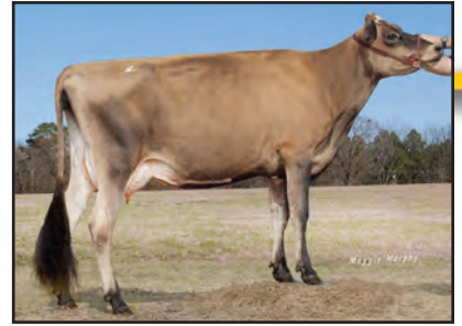
OOMSDALE LOUIE GARYN GEANNA{5}-ET Sister to Dam of Lot 30

7TH DAM: OOMSDALE SOONER GINA GROOVY 90% 6-05 305 3 20370 5.2 1058 4.0 824 DHIR 2683C