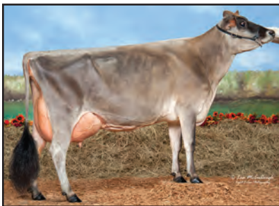
WF IATOLA ANAROSA Sister to Grandam of Lot 40F