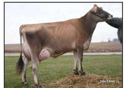
BUTTERCREST MECCA SNIP-ET Sister to Grandam of Lot 6