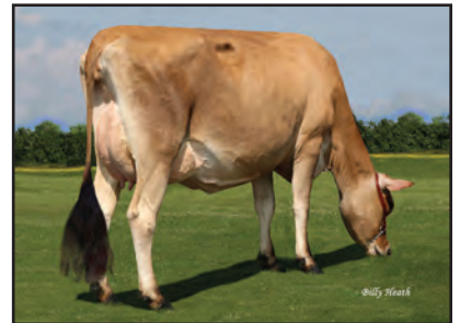
DUTCH HOLLOW PREMIER CHARISMA-ET Sister to Dam of Lot 22