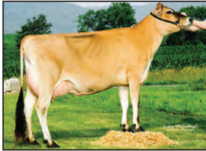
TC 1002 Rocket Favor, E-92% 3-0 305 20,830 4.7% 973 3.6% 746 Sold in the 2006 Sale