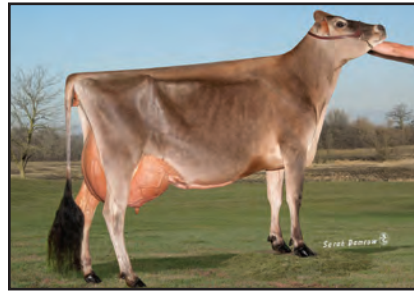
Hilmar Celebrity 26191, E-93% 3-11 305 25,770 5.3% 1,374 3.8% 972 Sold in the 2011 Sale