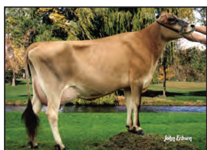
NOBLEDALE VICTORIAS SYDNEY-ET Fourth Dam of Lot 32