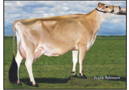
DUTCH HOLLOW PLUS CHARLA-ET Sister to Dam of Lot 22