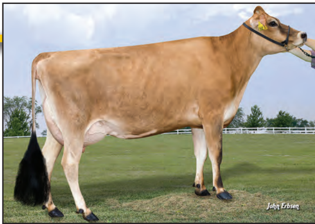
MULTI-ROSE DECOY 5517-ET, VG-85% Dam of Lot 3