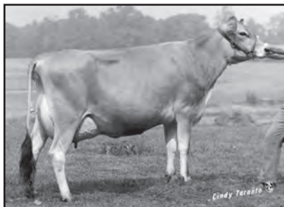
BILTMORE EARL BEE, E-90% Eleventh Dam of Lot 13 2015 Great Cow Contest Finalist