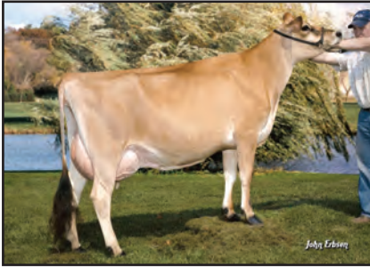
JVB Red Hot Saber BeBe, E-91% 3-2 305 24,270 4.5% 1,083 3.3% 804 Sold in the 2006 Sale

These well-known animals have shaped the Jersey breed as we know it today. Many sons, grandsons, and female descendants have made their mark on the A.I. industry and as mothers of sons around the country.