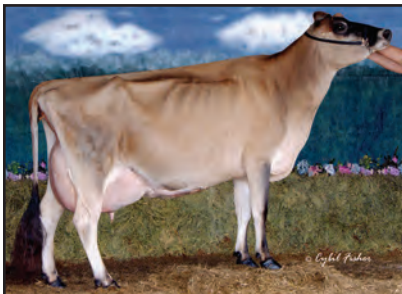
GIPRAT RENN ANASTASIA-ET Great-Grandam of Lot 40F