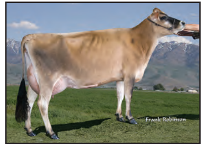
HAWARDEN JACE PIXY Sister to Dam of Lot 10A