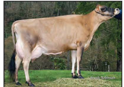
BW BOMBER LIZZIE ET299-ET Fourth Dam of Lot 3

6TH DAM: BW BERRETTA PRIZE G525 92% 3-1 305 2 25570 4.0 1014 3.7 936 DHIR 2843C 2015 GREAT COW CONTEST FINALIST