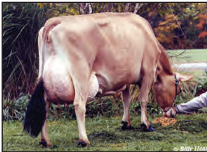
DEN-KEL LEMVIG JELLY-ET Great-Grandam of Lot 23