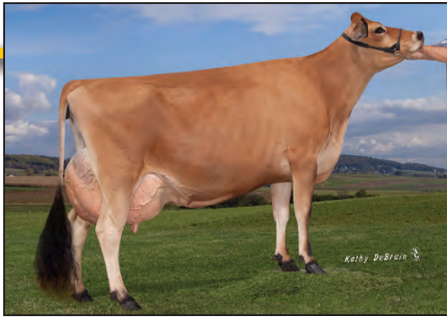
HI-LAND ZIPPER FLUFFY, VG-84% Dam of Lot 1