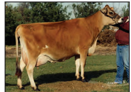
AHLEM LU CHARM, E-95% Eighth Dam of Lot 14