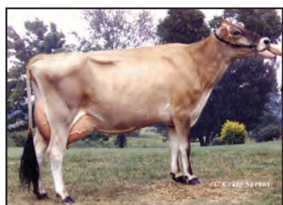
NOBLEDALE PITINO VICTORIA-ET Fifth Dam of Lot 32