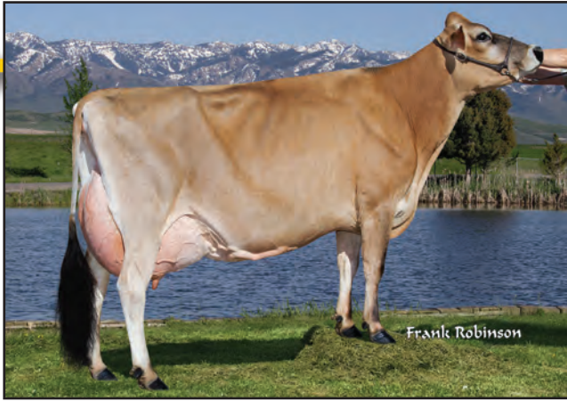
HAWARDEN JACE PIX, E-95% Dam of Lots 10A-10G (2011 photo)