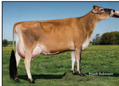
BLUE MIST VALENTINO MADDY-4-ET Sister to Dam of Lot 35