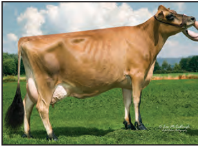
DEN-KEL IMPULS JULIE TOO Grandam of Lot 23