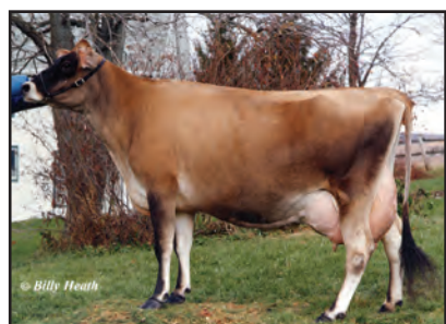
NOBLEDALE JUNO VERMONT Sixth Dam of Lot 32