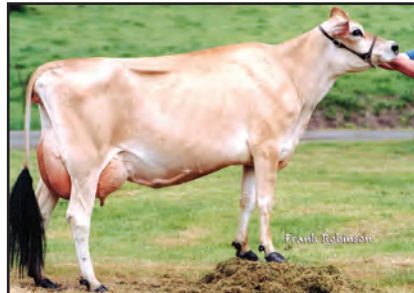
Scotch View Fair Halo, E-94% 6-7 305 23,980 4.3% 1,030 3.4% 808 Sold in the 2002 Sale