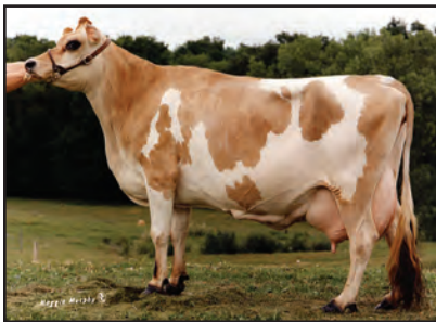
OGSTON VERTOLS JAYNE Fifth Dam of Lot 23