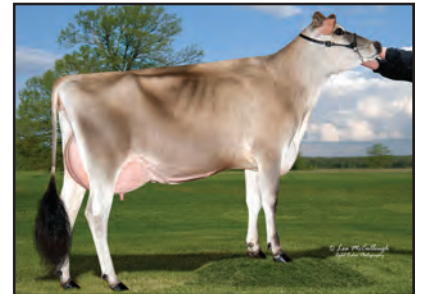
BELLWOOD CELEBRITY SASSY-ET Sister to Dam of Lot 6