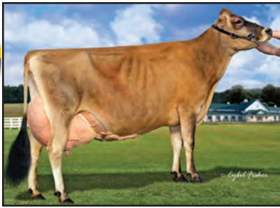
HAWARDEN JACE PIX Dam of Lot 10B (2012 photo)