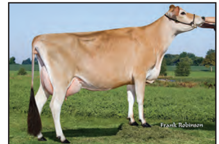
Jars of Clay Plus Vanessa, E-90% 1-10 305 14,960 4.8% 725 3.7% 549 Sold in the 2012 Sale