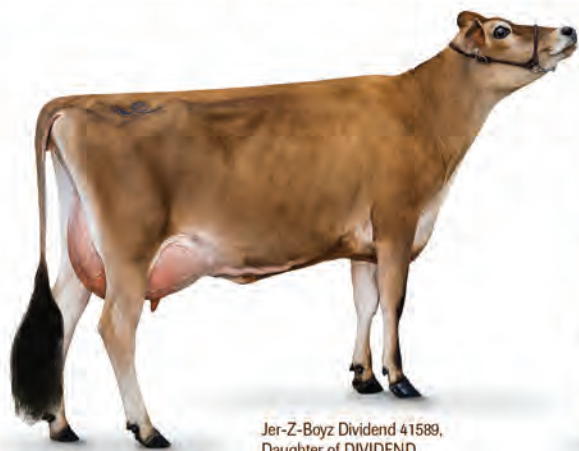
Jer-Z-Boyz Dividend 41589, Daughter of DIVIDEND