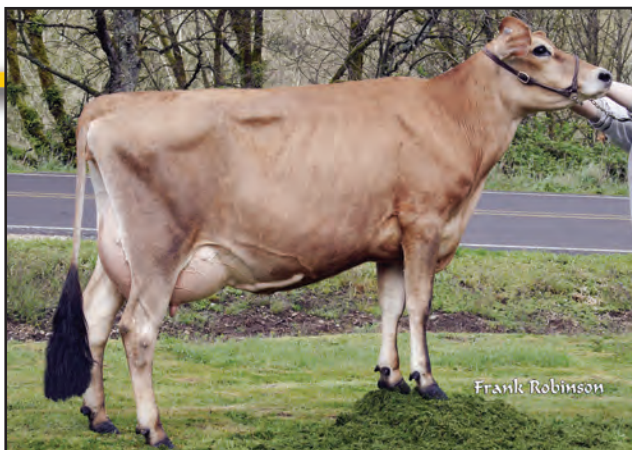
WOODSTOCK LV MORGAN LEXIE-ET, VG-81% Fourth Dam of Lot 13