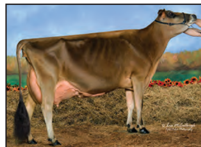
WF COUNCILLER ANANICOLE-ET Sister to Grandam of Lot 40E