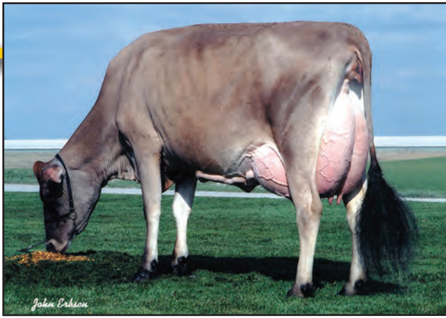
BUTTERCREST ROCKET SNAP, E-91% Great-Grandam of Lot 6