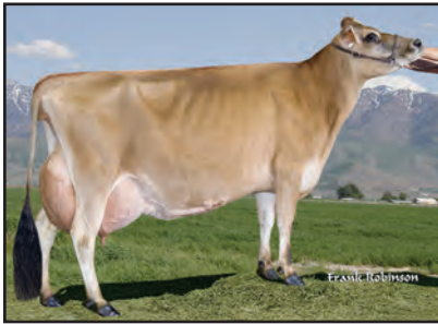
HAWARDEN PARAMOUNTS PIX Sister to Grandam of Lot 10B