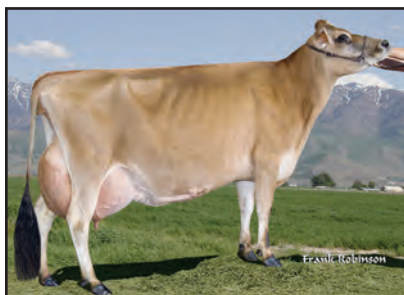
HAWARDEN PARAMOUNTS PIXY Sister to Grandam of Lot 10F