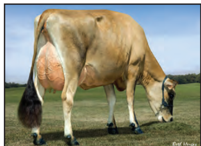
FREEMANS LEGAL SYLVIA Sister to the Grandam of Lot 32

7TH DAM: NOBLEDALE LEGEND VERTUS 92% 9-09 305 2 19030 4.2 796 3.6 688 DHIR 2169C