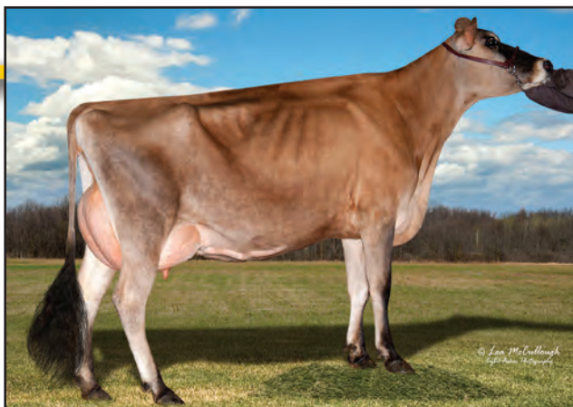
VAN DE ZUMA ZSA ZSA ZASU, VG-84% Dam of Lot 25