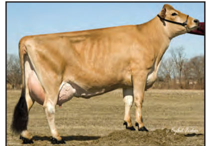
DUTCH HOLLOW LOUIE CHARITY Grandam of Lot 22