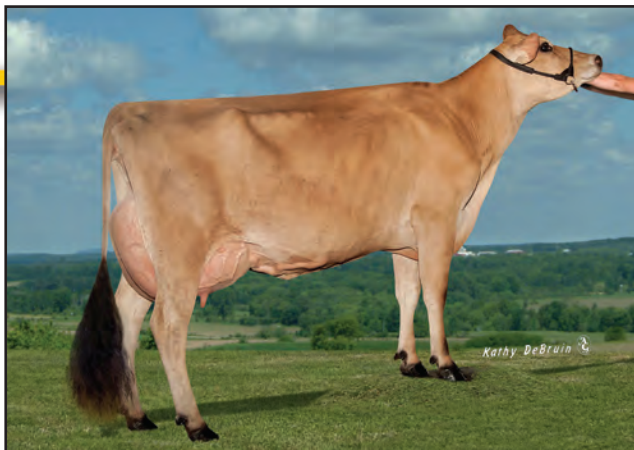
MFW RENEGADE BARON, E-90% Sister to Dam of Lot 13