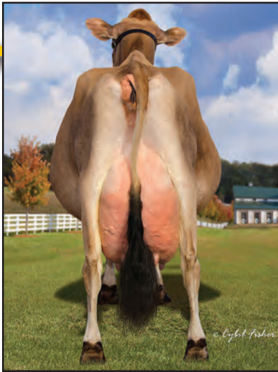
HAWARDEN JACE PIX Dam of Lot 10D