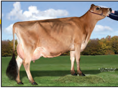
DEN-KEL JIGANTRESS-ET Dam of Lot 23