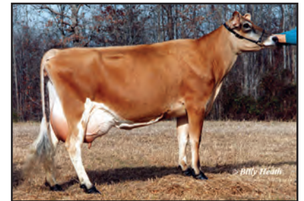
Headspring Sooner Kegan, E-91% 6-4 365 2 33,152 4.4% 1,466 3.2% 1,069 Sold in the 1991 Sale