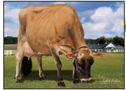
HAWARDEN JACE PIX Dam of Lot 10G