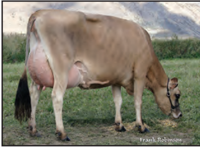
HAWARDEN FUTURE PIX Grandam of Lot 10B