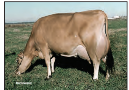
BW BERRETTA PRIZE G525 Sixth Dam of Lot 3