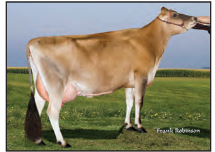
GR OOMSDALE CASEY CELEBRITY CHEYANN{3}-ET Sister to Grandam of Lot 30