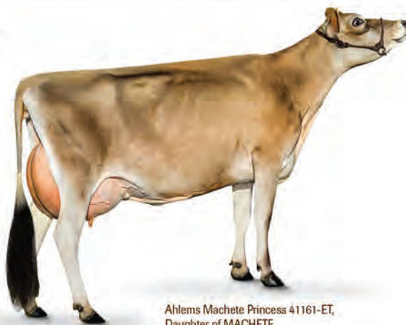
Ahlems Machete Princess 41161-ET, Daughter of MACHETE