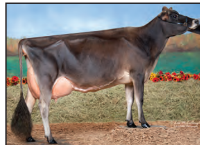
WF IATOLA ANAROSA Sister to Grandam of Lot 40E