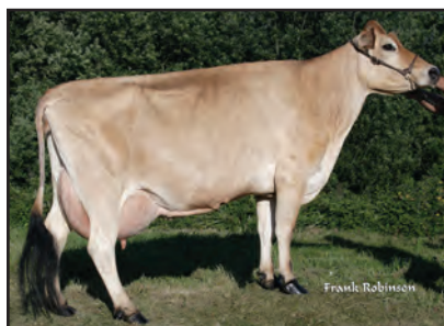
LEMVIG MOOKEY OF BLUE MIST-ET Great-Grandam of Lot 35