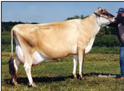
STARHEART DUNCAN ALPHA Fourth Dam of Lot 40F