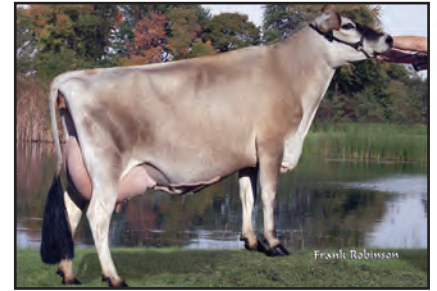
High Lawn Jace Cherie, E-90% 3-01 305 22,970 4.3% 986 3.4% 786 Sold in the 2005 Sale