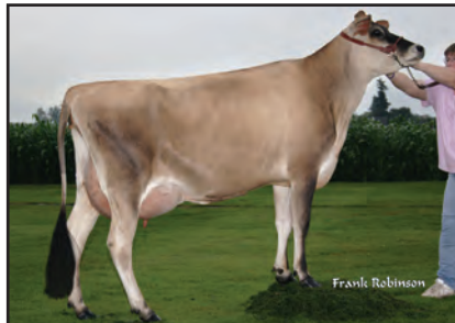
Stoney Hollow Bomber Jackie, E-90% 3-02 365 40,290 4.5% 1,818 3.4% 1,388 Sold in the 2004 Sale