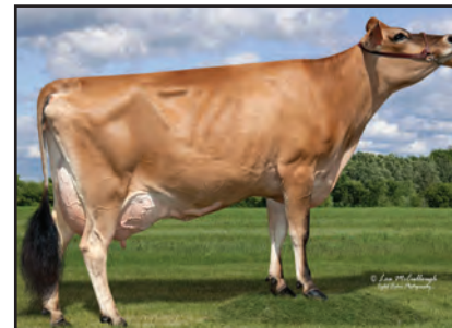
TJ/Lee Action Mamme 847-ET, VG-88% 3-1 305 3x 19,550 5.4% 1,053 3.7% 721 Sold in the 2009 Sale