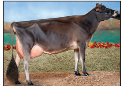
WF IATOLA ANAROSA Sister to Grandam of Lot 40E