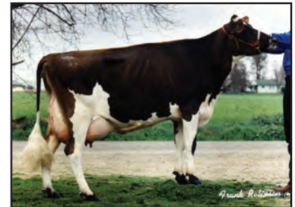
AHLEM GEORGES CHARM, E-90% Seventh Dam of Lot 14

6TH DAM: AHLEM MBSB CHARM 6777-ET 88% 4-02 305 2 26900 3.7 989 3.7 982 95DCR 2948C