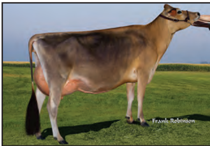
Free-Mar Blackstone Beeves, VG-86% 2-0 305 3x 24,630 4.2% 1,036 3.4% 845 Sold in the 2009 Sale