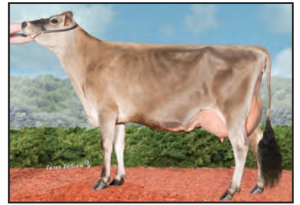
Family Hill Moment Fawn, VG-88% 2-11 305 17,430 6.1% 1,055 3.9% 673 Sold in the 2010 Sale