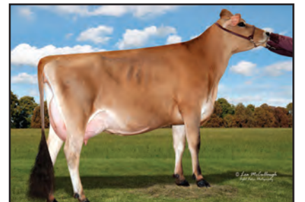
Heartland Topeka Madalyn-ET, VG-87% Projected to 23,311–1,198–885 ME at 1-9 Sold in the 2014 Sale