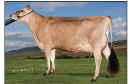
Cal-Mart Critic Perie 5958, VG-85% Projected to 16,892-901-602 ME at 1-10 Sold in the 2013 Sale