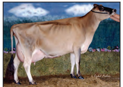
GIPRAT RENN ANASTASIA-ET Great-Grandam of Lot 40A