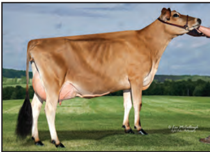
Marv Du Blackstone Easter-ET, VG-87% 2-2 305 16,360 5.5% 906 4.0% 662 Sold in the 2010 Sale