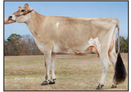
OOMSDALE LOUIE GARYN GINA{4}-ET Sister to Dam of Lot 30