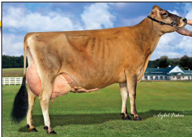
HAWARDEN JACE PIX, E-95% Dam of Lots 10A-10G (2012 photo)