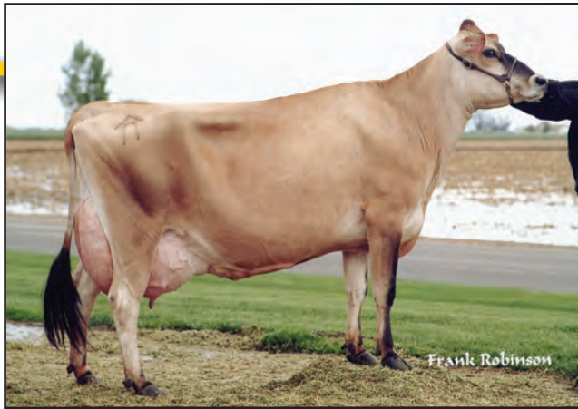
AHLEM MBSB PRUDENCE 7728, E-93% Fourth Dam of Lot 36