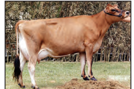
Berrys Declo Magnation-ET, E-90% 3-3 305 18,780 4.4% 832 3.8% 708 Sold in the 2000 Sale