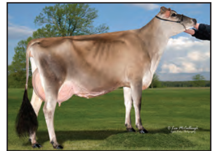
BELLWOOD CELEBRITY SATIN-ET Sister to Dam of Lot 6

4TH DAM: BUTTERCREST 67 SIX 75% 2-02 305 2 19300 6.0 1149 4.0 766 100DCR 2494C