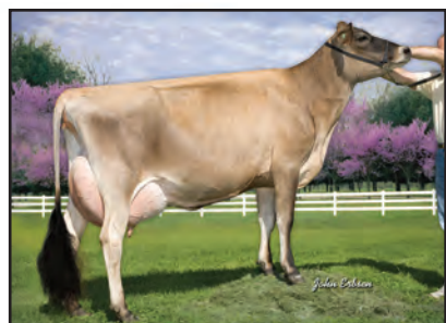
DAVE-RON IATOLA SYLVIA-ET Great-Grandam of Lot 32