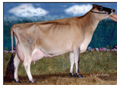
GIPRAT RENN ANASTASIA-ET Great-Grandam of Lot 40E

4TH DAM: STARHEART DUNCAN ALPHA EX 2E (CAN) 3-01 305 2 19790 3.5 692 3.8 750 CAN 2153C 2 STAR BROOD COW IN CANADA, DECEMBER 2011 RESERVE NATIONAL GRAND CHAMPION, 1992 & 1994 ALL CANADIAN MATURE COW, 1994 1ST MATURE COW, 1994 RICHMOND HILL FAIR 1ST MATURE COW, 1994 ROYAL AG WINTER FAIR NOMINATED ALL CANADIAN FOUR YEAR OLD, 1992 NOMINATED ALL CANADIAN FIVE YEAR OLD, 1993