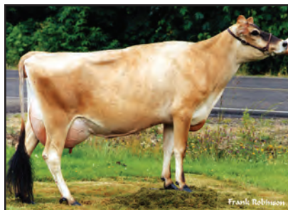
WOODSTOCK BERRETTA LESLIE Seventh Dam of Lot 19