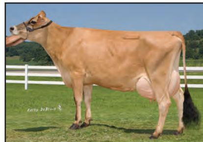
Boyd-Lee Matinee Habanero-ET, E-90% 4-6 305 3x 23,850 5.3% 1,263 3.6% 790 Sold in the 2008 Sale