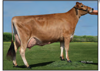
DUTCH HOLLOW PLUS CHARMAINE-ET Dam of Lot 22

DUTCH HOLLOW MONTANA CHERRY 85% 1-08 305 2 21650 4.3 923 3.2 701 100DCR 2420C