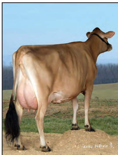
IMPULS ZAP ZELENA OF VAN DE Great-Grandam of Lot 25