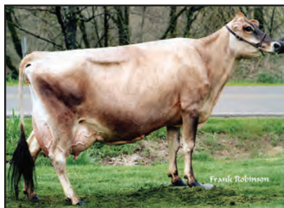
WOODSTOCK ALF LESLIE Sixth Dam of Lot 19