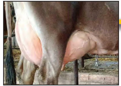
SHERONA MINISTER ANGEL Dam of Lots 40A-40G

WF CENTURION ALANIS 91% 5-05 305 2 18360 4.9 899 3.9 719 98DCR 2438C WF CENTURION ANABELLA-ET 94% 4-00 305 2 15310 4.9 748 3.9 598 98DCR 2028C 5TH SENIOR THREE-YEAR-OLD, 2011 ALL AMERICAN SHOW 7TH NATIONAL JERSEY JUG FUTURITY, 2011 WF MOMENT ANALOU-ET 94% 5-09 305 2 16090 5.6 903 4.0 648 98DCR 2244C 2ND SR 2-YEAR-OLD, 2010 MID ATLANTIC REGIONAL SHOW 1ST SENIOR THREE-YEAR-OLD, 2011 MD STATE FAIR 4TH SR 3-YEAR-OLD, 2011 MID ATLANTIC REGIONAL SHOW 4TH NATIONAL JERSEY JUG FUTURITY, 2011 WF MOMENT ANTONET-ET 87% 2-04 305 2 12050 4.8 576 3.8 458 97DCR 1557C WF IATOLA ANAROSA 94% 5-04 284 2 17370 4.8 836 3.6 631 97DCR 2182C 1ST JR 3-YEAR-OLD, 2011 MID ATLANTIC REGIONAL SHOW 6TH JR 2-YEAR-OLD, 2010 MID ATLANTIC REGIONAL SHOW 10TH JUNIOR THREE-YEAR-OLD, 2011 ALL AMERICAN SHOW WF COUNCILLER ANTICIPATION-ET 85% 2-02 296 2 11020 5.3 584 3.6 395 96DCR 1365C