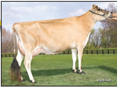
WF COUNCILLER ANAKORNIKOVA-ET Grandam of Lot 40F