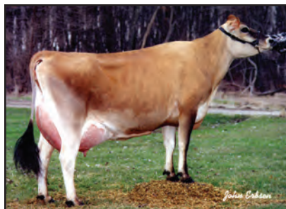
BOHNERTS BUCK ABIGALE Fourth Dam of Lot 9