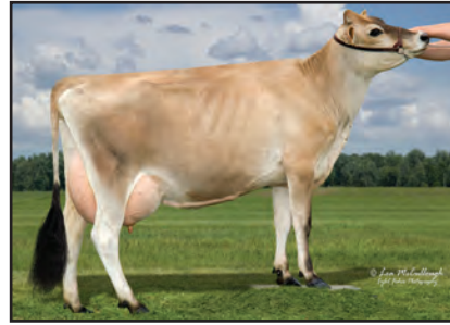
Dupat Jevon 5557-ET, VG-80% 2-9 305 20,030 4.6% 922 3.6% 722 Sold in the 2009 Sale