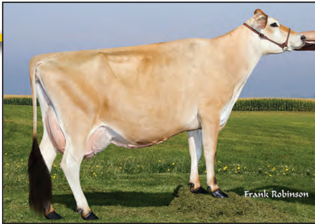
AHLEM LEGAL CHARM 35621, VG-85% Dam of Lot 14