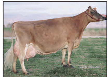
HAWARDEN ATLANTIS PIXY B Great-Grandam of Lot 10A