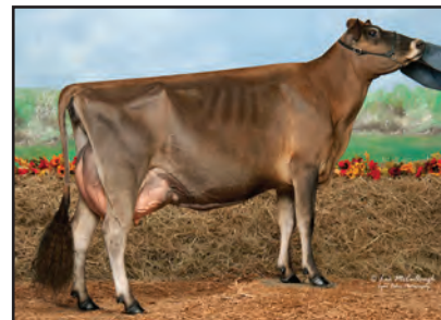
WF MOMENT ANALOU-ET Sister to Grandam of Lot 40E