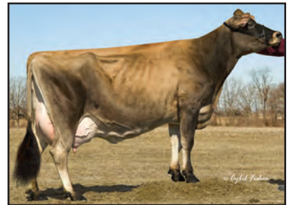
PR OOMSDALE GRATITUDE COUNTRY CASEY{2}-ET Great-Grandam of Lot 30