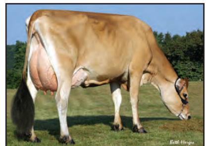
DUTCH HOLLOW VALENTINO CHERYL-ET Siter to Grandam of Lot 22