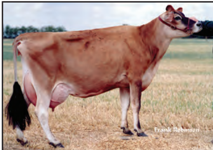
Buttercrest Klassic Glow-ET, VG-89% 3-09 305 32,420 4.9% 1,590 3.3% 1,065 Sold in the 2002 Sale