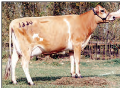
CJF DUNCAN BEE BABE, VG-87% Eighth Dam of Lot 13