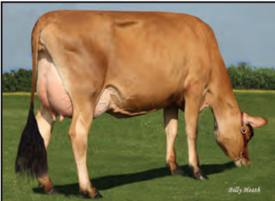
HILLVIEW LOUIE KATI-KI-P Sister to Lot 21