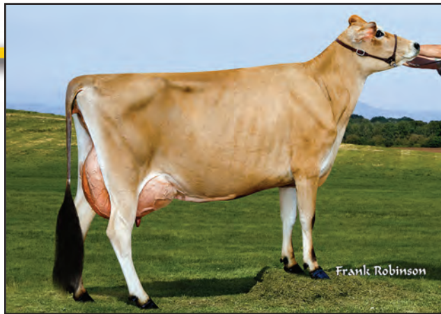
FOREST GLEN LEGALS GOLDEN EGG, VG-83% Sister to Grandam of Lot 5