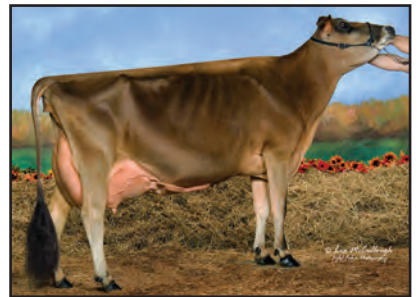
WF COUNCILLER ANANICOLE-ET Sister to Grandam of Lot 40A