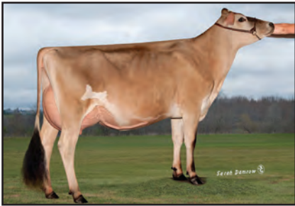
All Lynns Irwin Trista-ET, VG-84% Projected to 18,783–851–651 ME at 1-9 Sold in the 2013 Sale

The production is bred into every heifer selected for the National Heifer Sale. Buyers of previous consignments have realized the benefits of this potential.