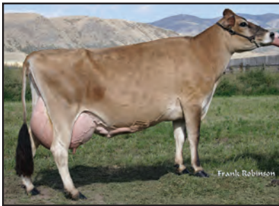
HAWARDEN MANNIX PIX Sister to Grandam of Lot 10D