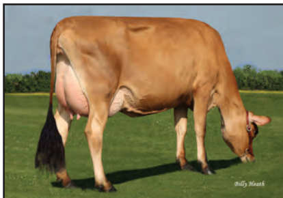
Hillview Louie Katiki-P, VG-86% 1-10 305 3x 21,320 4.4% 932 2.9% 622 Sold in the 2013 Sale