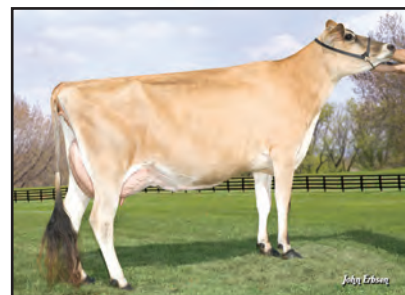
WF COUNCILLER ANAKORNIKOVA-ET Grandam of Lot 40E