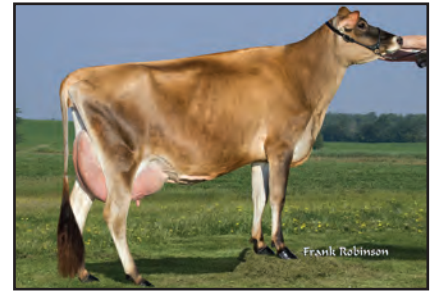
Pearlmount Jimmie Dawn-ET, E-90% 1-11 305 17,226 4.0% 686 3.7% 644 Sold in the 2010 Sale