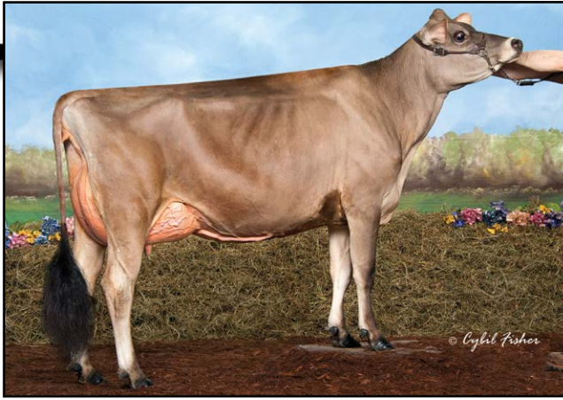
GLENVIEW TEQUILA FAWN, VG-89% Full Sister to Lot 118