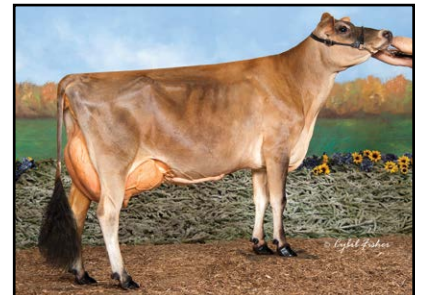
GLENVIEW IATOLA FELICIA Sister to Dam of Lot 118