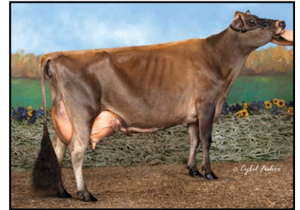
GLENVIEW COMERICA FRANNIE Dam of Lot 118