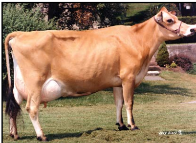
SUNRISE SQUIRE ALICIA Fourth Dam of Lot 117

BORN 01/27/2016 TATTOO / C117 FEMALE EFI 5.0%