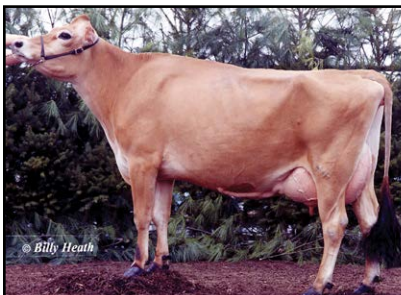
PENNWOOD REMAKE ABBIE-ET Great-Grandam of Lot 117