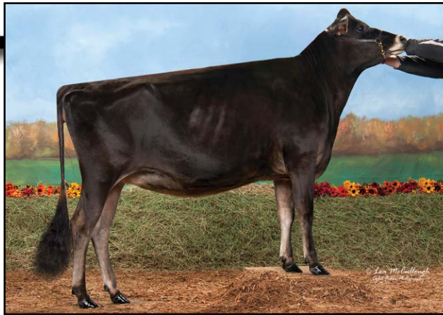
GLENVIEW TEQUILA AVA, VG-88% Full Sister to Lot 117