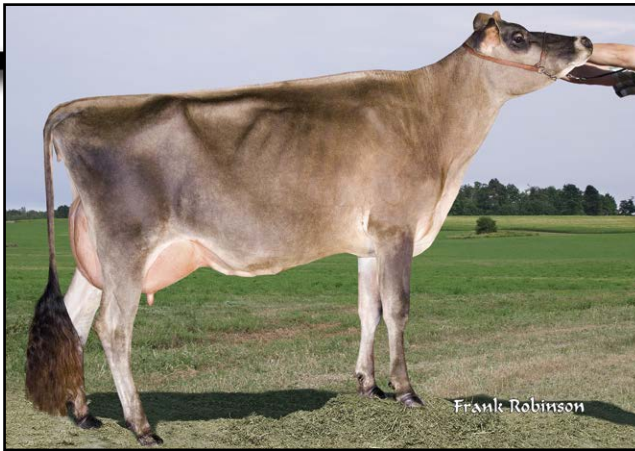
MORDALE J.W.CHRISSIE-ET, VG-88 (CAN) Grandam of Lot 109