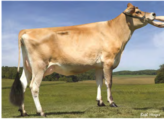
MENDA LABATT EASEL, E-92% SISTER TO THE GRANDAM OF LOT 222