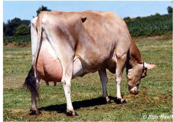
MVF BARBER SOONER J 484, E-92% FOURTH DAM OF LOT 221