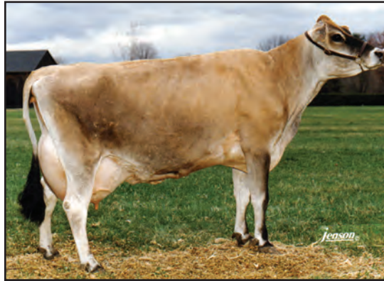
PASSIONS HALPINT PATIENCE-ET, E-92%GRANDAM OF LOT 244