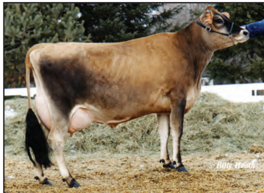
MAPLELINE ALF FULLPINT, VG-87% SISTER TO THE DAM OF LOT 244