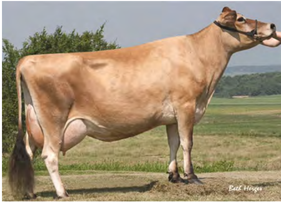
MENDA NATHAN SILVER-ET, E-91% SISTER TO THE GRANDAM OF LOT 221