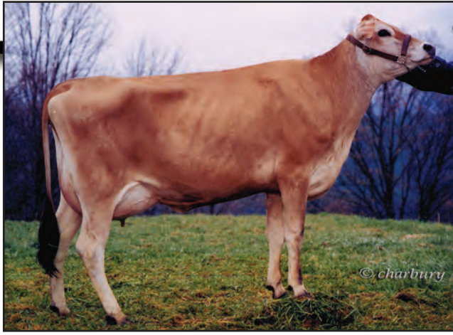
PEARLMONT HALLMARK L CLASSY, E-92% Great-Grandam of Lot 9