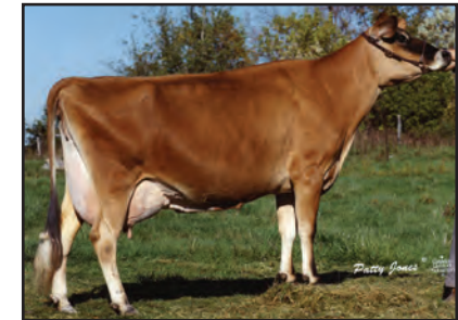
NORVAL ACRES KINGS DELCY 4N Fourth Dam of Lot 3

GIPRAT BELLES CHAIRMAN-ET JECAN000010203360 GT 50K BBR 100 JH1F JH2F 200JE415 CDCB GPTA 04/01/2018 1351DAUS 523HRDS 3%RIP 98%R -864M 0.07% -27F 0%ILE 98%R 0.02% -27P -116CM$ -111NM$ -101FM$ -102GM$ 1.8PL 0.4DPR 1.5CCR 0.4HCR 3.10SCS AJCA 04/01/2018 853DAUS GPTAT 97%R 0.9 GJUI 11.7 GJPI 96%R -41