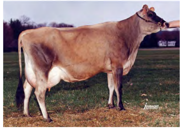
GREENWIND BERRETTA DECEMBER {6}, E-93% GREAT-GRANDAM OF LOT 241