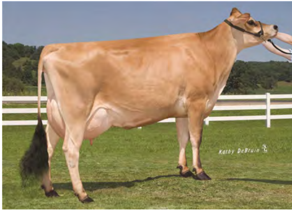
KEMPKO MILITIA DEB, E-91% SISTER TO THE DAM OF LOT 245