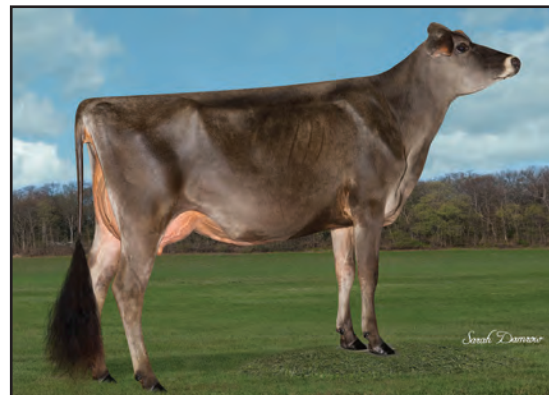
BILLINGS IMPRESSION BACKSTAGE-ET, VG-88% SISTER TO THE GRANDAM OF LOT 107