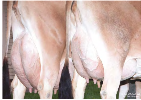
BILLINGS BERRETTA DART, E-91% AND BILLINGS CHAIRMAN DOROTHY, EX 90-3E (CAN) SISTERS TO THE GRANDAM OF LOT 300