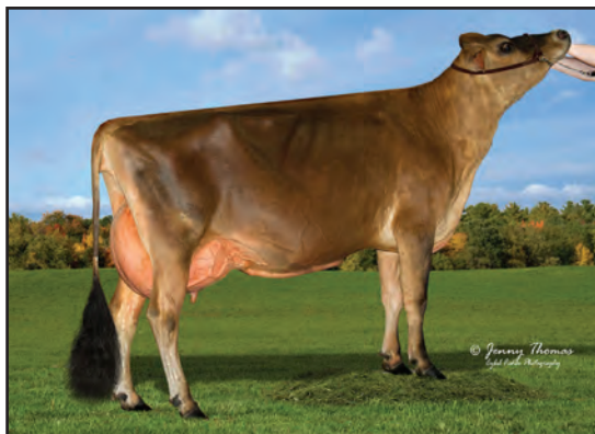
BILLINGS MINISTER BREIGH, E-92% SISTER TO THE GRANDAM OF LOT 107