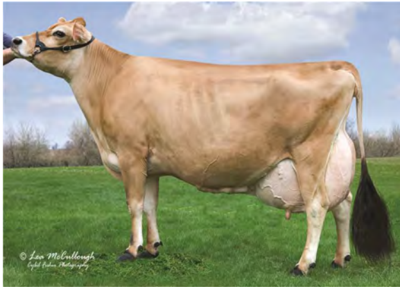
BILLINGS BERRETTA DARLA, E-91% SISTER TO THE GRANDAM OF LOT 300