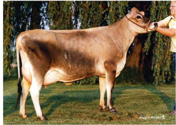
DUTCH HOLLOW LESTER MISCHIEF-P-ET, E-91% SIXTH DAM OF LOT 282