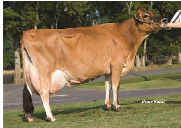
BERRYS PARADE MEDLEY, E-91% FIFTH DAM OF LOT 168