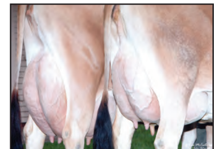
BILLINGS CHAIRMAN DOROTHY-ET Dam of Lot 3 (udder view), pictured with her sister BILLINGS BERRETTA DART

BILLINGS LESTER DARLYNE 94% USA 003849420 GT TATTOO / BF749 DHIA HERD # 13-14-0202 CONTROL # 749 2-01 305 2 8130 5.3 430 3.9 315 DHIR 1025C 3-09 305 2 12130 5.6 678 3.7 454 DHIR 1477C 4-10 295 2 14330 5.3 756 4.0 567 DHIR 1846C 5-10 289 2 13770 5.5 755 3.8 530 99DCR 1725C 6-10 305 2 13530 5.4 736 3.7 500 99DCR 1729C 8-00 304 2 15350 5.3 812 3.5 544 99DCR 1880C 9-00 305 2 13100 5.3 689 3.7 484 100DCR 1674C 10-03 305 2 16930 5.4 910 3.6 614 100DCR 2123C 11-10 305 2 17530 5.4 946 3.6 630 100DCR 2178C 305 2X ME AVG 9L 14248M 767F 529P 1783C PPA -3640M -115F -91P / YD -4138M -143F -118P CDCB PTA 04/01/2018 5RECS 64%R 0%ILE -2107M -75F -63P -461CM$ -464NM$ -473FM$ -390GM$ 0.1PL 1.9DPR 2.2CCR -0.7HCR 2.89SCS AJCA 04/01/2018 PTAT 55%R -1.3 JUI 0.3 JPI 54%R-141