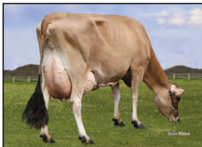
LUCKY HILL JOKER WABORITA Grandam of Lot 4