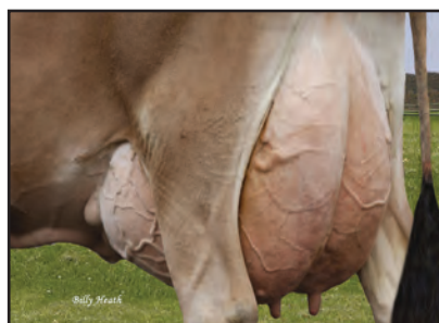
LUCKY HILL JOKER WABORITA Grandam of Lot 4