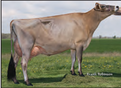
PARTEE AT BUDJON LIBERTY-ET Sister to the Grandam of Lot 12