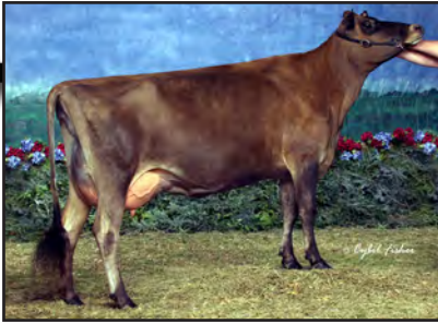
HOMERIDGE F P LISA 2 Great-Grandam of Lot 12