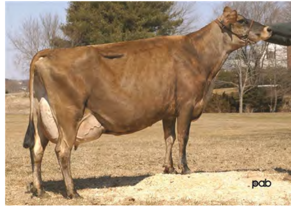
KEMPKO LEMVIG DEBORHA, E-93% GREAT-GRANDAM OF LOT 245