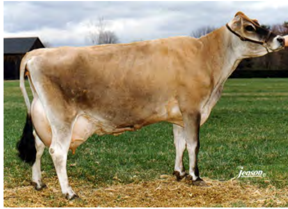
PASSIONS HALFPINT PATIENCE-ET. E-92% FOURTH DAM OF LOT 249