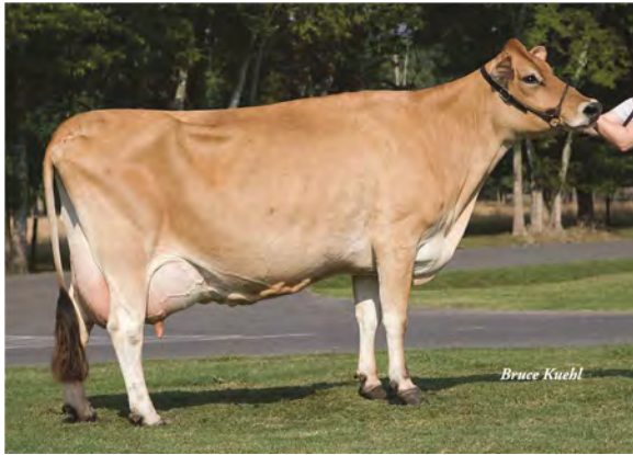
BERRYS DANIEL MINDI, E-90% FOURTH DAM OF LOT 168