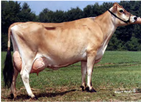
DUTCH HOLLOW BARBER MIMIC-P-ET, VG-81% FIFTH DAM OF LOT 282