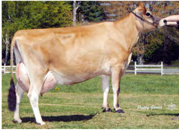
MAPLELINE BLUE MANDIE, E-90% FOURTH DAM OF LOT 246