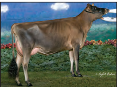
PARTEE AT BUDJON LYNSAI-ET Sister to the Grandam of Lot 12