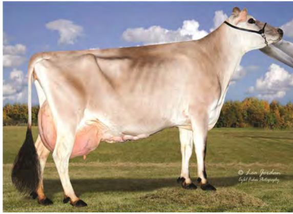
CATOS ACTION GIRASOL, VG-88% SISTER TO THE DAM OF LOT 229