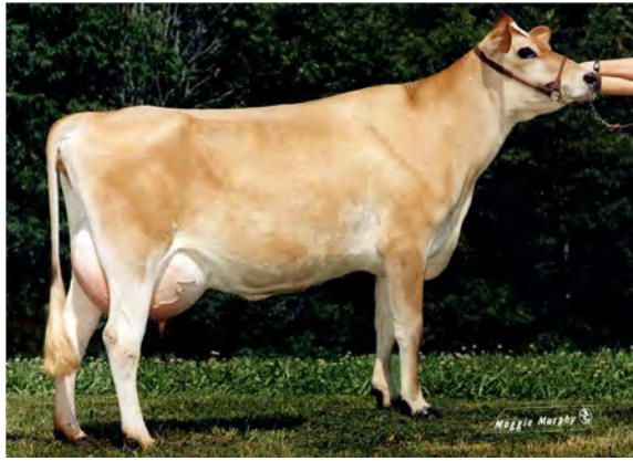
MOLLY BROOK BOOMER SOONER PRIDE, E-90% FIFTH DAM OF LOT 164