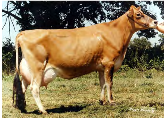
DUTCH HOLLOW TWISTER DELILAH, E-93% FIFTH DAM OF LOT 280