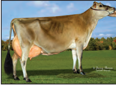
BILLINGS ACTION SASSY Dam of Lot 8