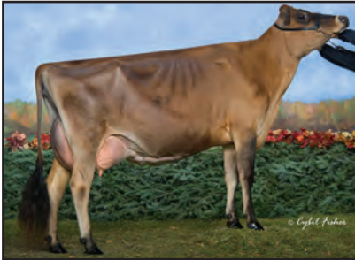
PARTEE AT BUDJON LAST CALL Sister to the Grandam of Lot 12