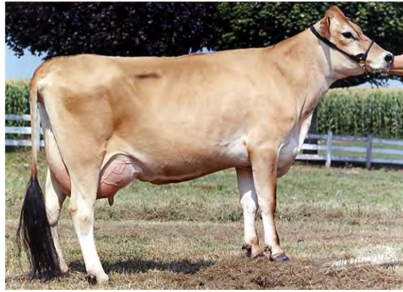
MEDALLION MANNIX CELEBRATION-TWIN, VG-84% FOURTH DAM OF LOT 289