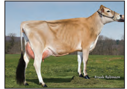
HIGH LAWN HEADLINE QUARTZ-ET Grandam of Lot 7

DUTCH HOLLOW MIK OLIVE-P 93% USA 116469076 GT8K BBR 100 JH1F JH2F TATTOO E799 / E799 DHIA HERD # 21-10-0357 CONTROL # 3799 2-08 305 3 22050 5.5 1210 3.5 767 102DCR 2651C 5-03 305 3 21260 5.3 1131 3.3 712 101DCR 2459C 6-08 305 3 24000 5.3 1277 3.4 818 102DCR 2826C 7-08 305 3 27650 4.7 1302 3.4 953 102DCR 3293C 305 2X ME AVG 5L 21253M 1170F 751P 2595C PPA 43M 91F 8P / YD -758M 59F -9P CDCB GPTA 04/01/2018 4RECS 86%R 80%ILE -70M 39F 3P 261CM$ 250NM$ 224FM$ 199GM$ 2.5PL -0.8DPR -0.9CCR 0.5HCR 2.89SCS AJCA 04/01/2018 GPTAT 82%R 1.6 GJUI 21.8 GJPI 79%R 71