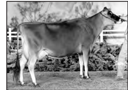
NORVAL ACRES JODYS DELCY 4U Great-Grandam of Lot 3

STEINHAUERS H MARK APPLEPIE 92% USA 113506044 GT50K BBR 100 JH1F JH2F TATTOO S42 / S42 DHIA HERD # 35-59-1096 CONTROL # 42 3-04 278 2 18020 5.1 927 3.7 664 94DCR 2296C 4-03 305 2 23540 4.7 1117 3.8 888 94DCR 3020C 5-03 305 2 20350 4.6 926 3.6 729 98DCR 2491C 6-03 305 2 17130 4.6 796 3.7 628 98DCR 2144C 305 2X ME AVG 5L 21394M 1022F 786P 2698C PPA -32M 36F 19P / YD 83M 36F 20P CDCB GPTA 04/01/2018 5RECS 90%R 25%ILE -121M 3F 0P 47CM$ 46NM$ 42FM$ 101GM$ 0.4PL 1.8DPR 2.2CCR -0.2HCR 3.16SCS AJCA 04/01/2018 GPTAT 88%R 1.4 GJUI 21.2 GJPI 85%R 27