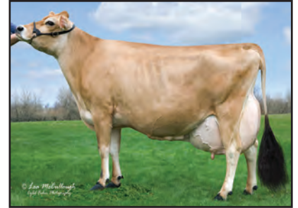
BILLINGS BERRETTA DARLA Sister to the Dam of Lot 3

SC GOLD DUST PARAMOUNT IATOLA-ET USA 112118277 GTHD BBR 100 JH1F JH2F 29JE3301 CDCB GPTA 04/01/2018 18361DAUS 2543HRDS 6%RIP 99%R -284M 0.10% 6F 0%ILE 99%R 0.05% -1P 64CM$ 51NM$ 20FM$ 52GM$ 0.6PL -0.1DPR 0.0CCR 0.1HCR 2.97SCS AJCA 04/01/2018 9562DAUS GPTAT 99%R 1.3 GJUI 13.1 GJPI 99%R 21