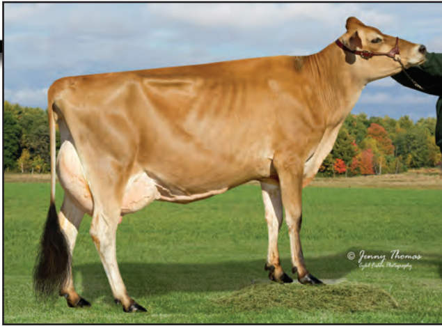
LUCKY HILL JOKER PHLOPSIE, E-90% Grandam of Lot 1