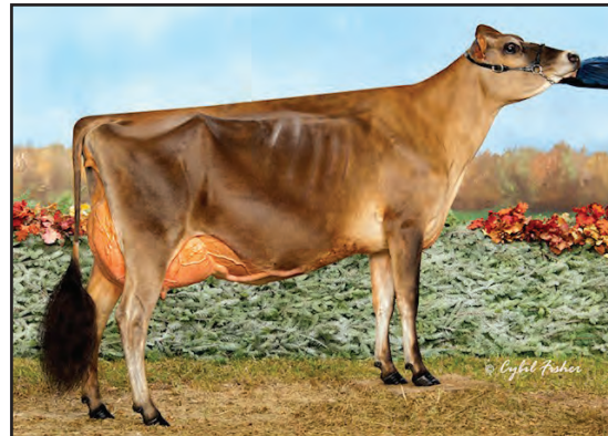
BILLINGS IMPRESSION OF BOOBOO-ET, VG-88% SISTER TO THE GRANDAM OF LOT 107