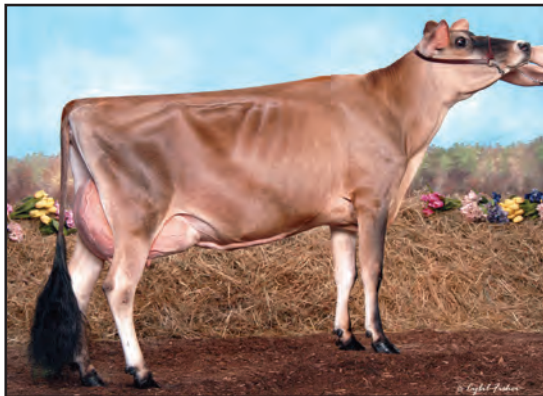
BILLINGS JADE BRYANT, E-92% SISTER TO THE GRANDAM OF LOT 107