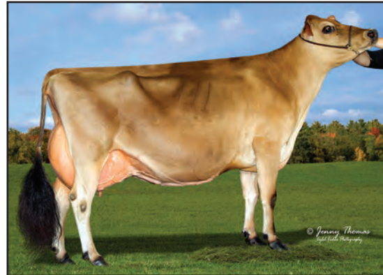
BILLINGS SULTAN BRYCE, E-95% GRANDAM OF LOT 107