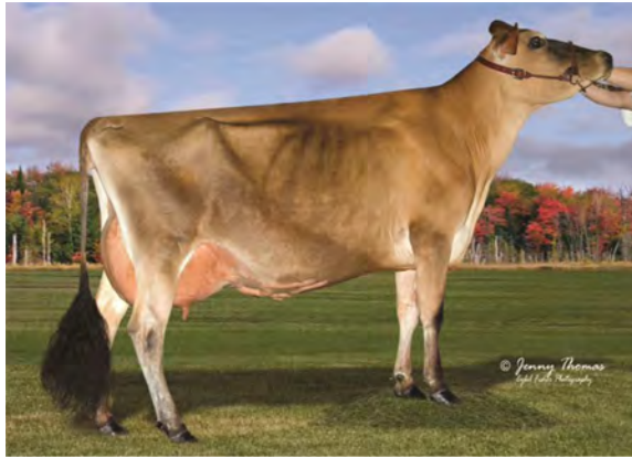
MENDA EXCITATION LYNSDAY-ET, E-94% GRANDAM OF LOT 298