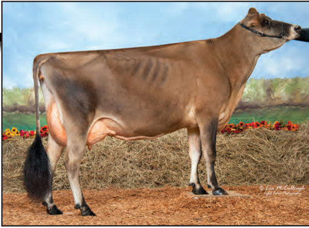
FORTRESS JUSTICE JAN, E-93% Grandam of Lot 25