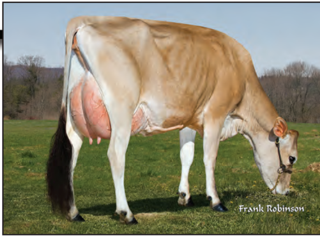
HIGH LAWN HEADLINE QUARTZ-ET, VG-83% Grandam of Lot 7