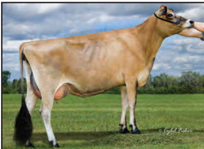
PARTEE AT BUDJON FUROR LAYLA Sister to the Grandam of Lot 12