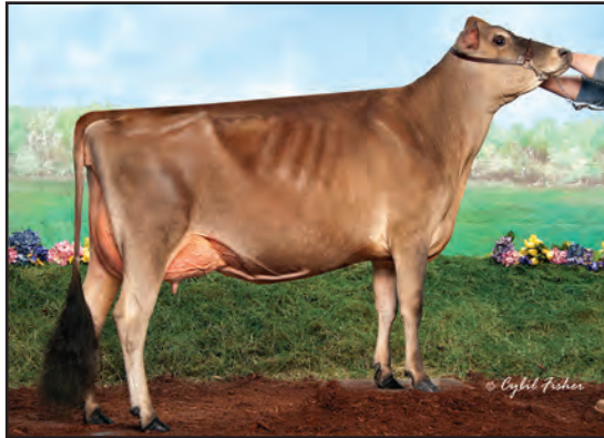
BILLINGS GROVE BRIANNA, E-91% DAM OF LOT 107