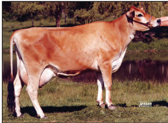
POCANTICO DUNCAN PASSION, E-92% GREAT-GRANDAM OF LOT 244