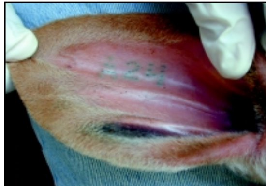
A legal tattoo has at least one number and one letter. After several weeks, the tattoo should become legible as the dried ink flakes out of the calf's ear.

Sanitize tongs between calves by spraying rubbing alcohol on the tongs and the individual tattoo pieces. This should be done before and after each procedure.